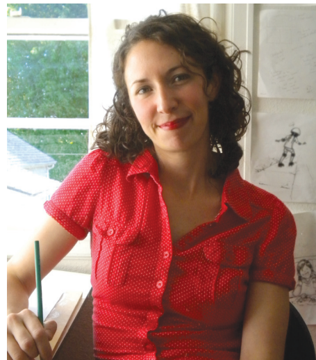
The author in her Portland, Oregon painting studio