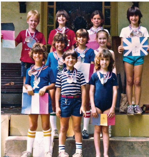
The unhappy author ( front, right ), after her disappointing performance in her street's 1984 Kid Olympics