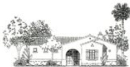
House of Spain/Casa de España San Diego