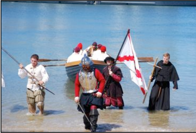
Cabrillo landing on the shores of San Diego...

We thank all the volunteers who helped make this day a success. Here we have some photos: