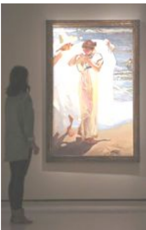
"Coming out of the bath"

The exhibition, and its replicas in Boston and Buffalo made Joaquín Sorolla (1863-1923), already enshrined in places such as London or Paris, a tremendously popular artist in the USA; only the New York stop of 1909 accounted for more than 160,000 visits. The show that now comes to Madrid, after passing through the museums of San Diego and The Meadows Museum of Dallas, where attendance records were broken, try for the first time to unravel the strange story of love among the American elite and the painter of Mediterranean spirit through the works of art acquired or commissioned by collectors from that corner of the world. And it does so with a wide battery of exceptional loans and material never seen in Spain or directly unpublished, which is the result of an investigation led by Blanca Pons-Sorolla, great granddaughter of the artist, exhibition curator and author of a forthcoming catalog whose inventory exceeds four thousand works.