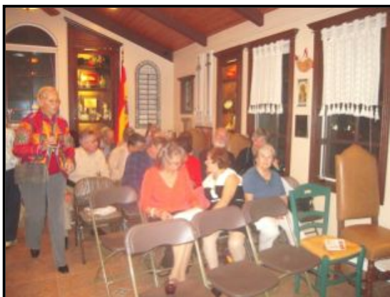
A partial view of the attendees