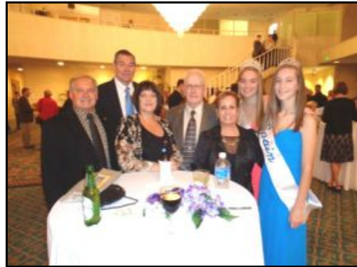
Attendees to the event