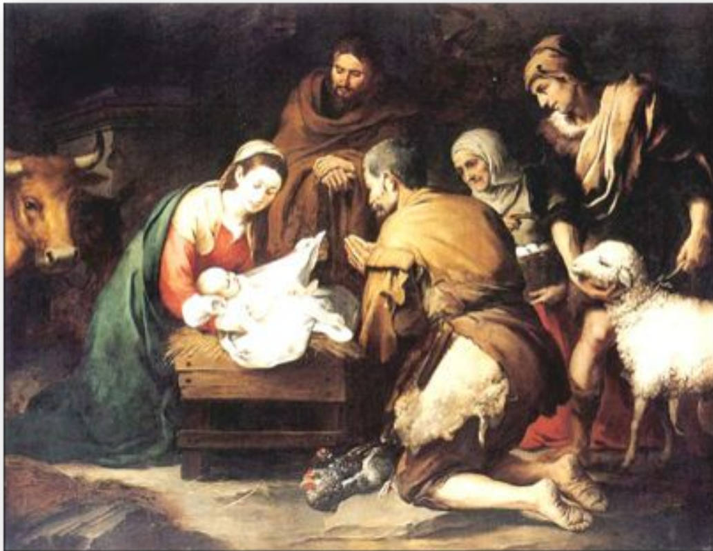
Adoration of the Shepherds (Bartolomé Murillo)

OUR WISHES TO ALL OUR MEMBERS AND FRIENDS OF HOUSE OF SPAIN/CASA DE ESPAÑA IN SAN DIEGO