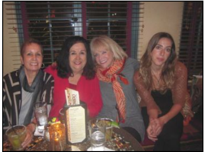
Enjoying the "Happy Hour"