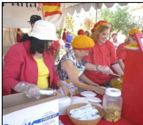
The volunteers: serving our delicious paella