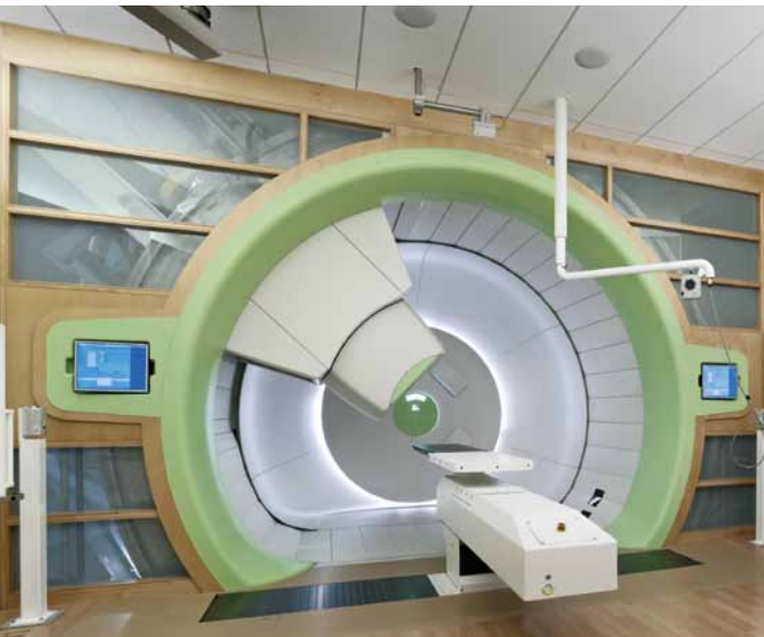
The Children's Hospital of Philadelphia