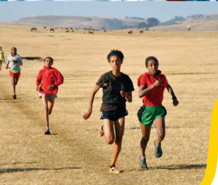
Bottom » Dire Tune after winning the 2008 Boston Marathon

around a 5K dirt loop at a 4:23-per-kilometre pace that will get faster with every lap.