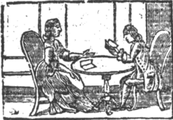
A little Boy and Girl reading.

ALL good Boys and Girls take Care to learn their Lessons, and read in a pretty Manner ; which makes every Body admire them.