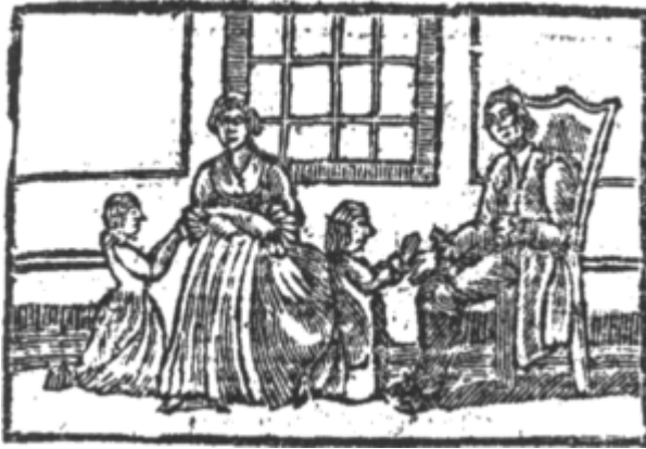
A little Boy and Girl asking a Blessing of their Parents.

ALL good Boys and Girls kneel down every Morning and Evening and ask their Parents Blessing in these Words, "Pray Papa and Mamma, pray to God to bless me, and make me his true and faithful Servant." Which makes their Friends love them.