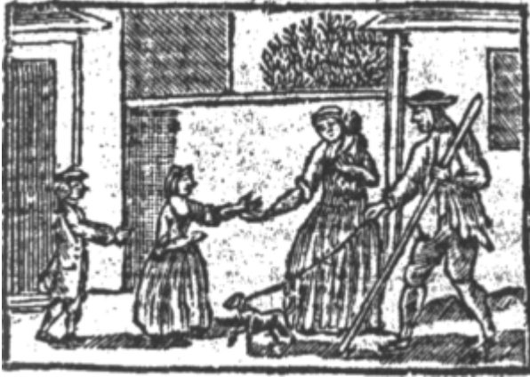
A little Boy and Girl bestowing their Charity.

ALL good Boys and Girls, when they see a poor Man, or Woman, or a Child in Want, will give them either Money or such Meat and Drink as they have to spare ; which makes the whole World love them.