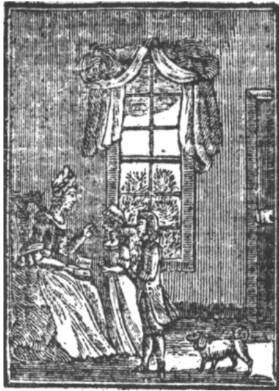
Instruction with Delight