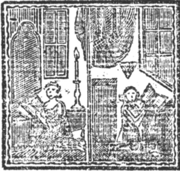
A little Boy and Girl at Prayers.

ALL good Boys and Girls say their Prayers at Night, and in the Morning, which makes God Almighty love and bless them.