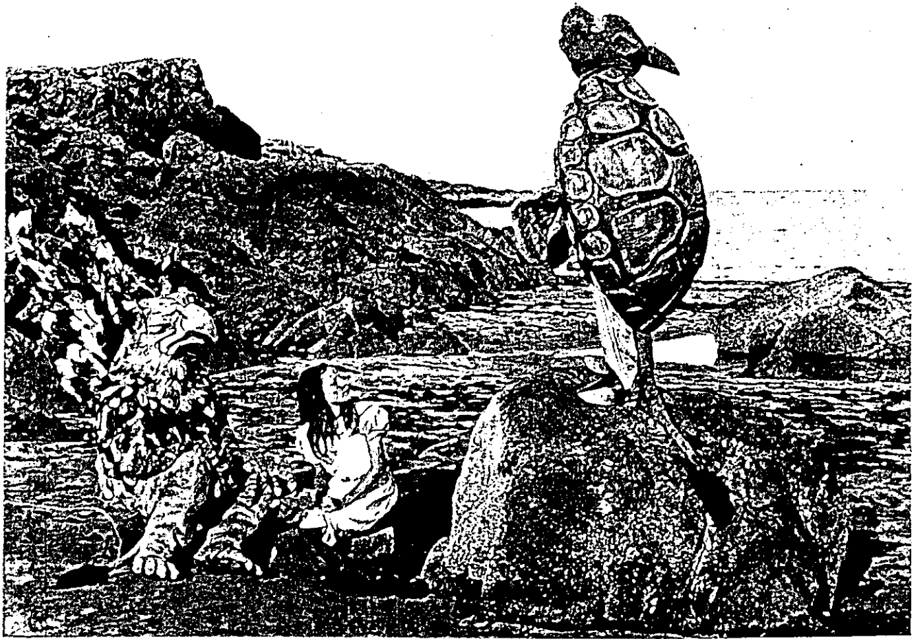
Fig. 6—1915 Mock Turtle filmed at Cape Ann, Mass.

The latest feature film adaptation of Alice in Wonderland was produced by Joseph Shaftel in 1972. The film, in wide screen Technicolor, should have been a success since it is both visually beautiful and is laden with a cast of stars. The sets faithfully followed Tenniel and the dialogue is from the book. The songs, however, are not in the Carroll spirit and tend to ruin the film's continuity. The film was not well received in either England or America. It is now available for 16mm. rental, and is shown frequently on television.