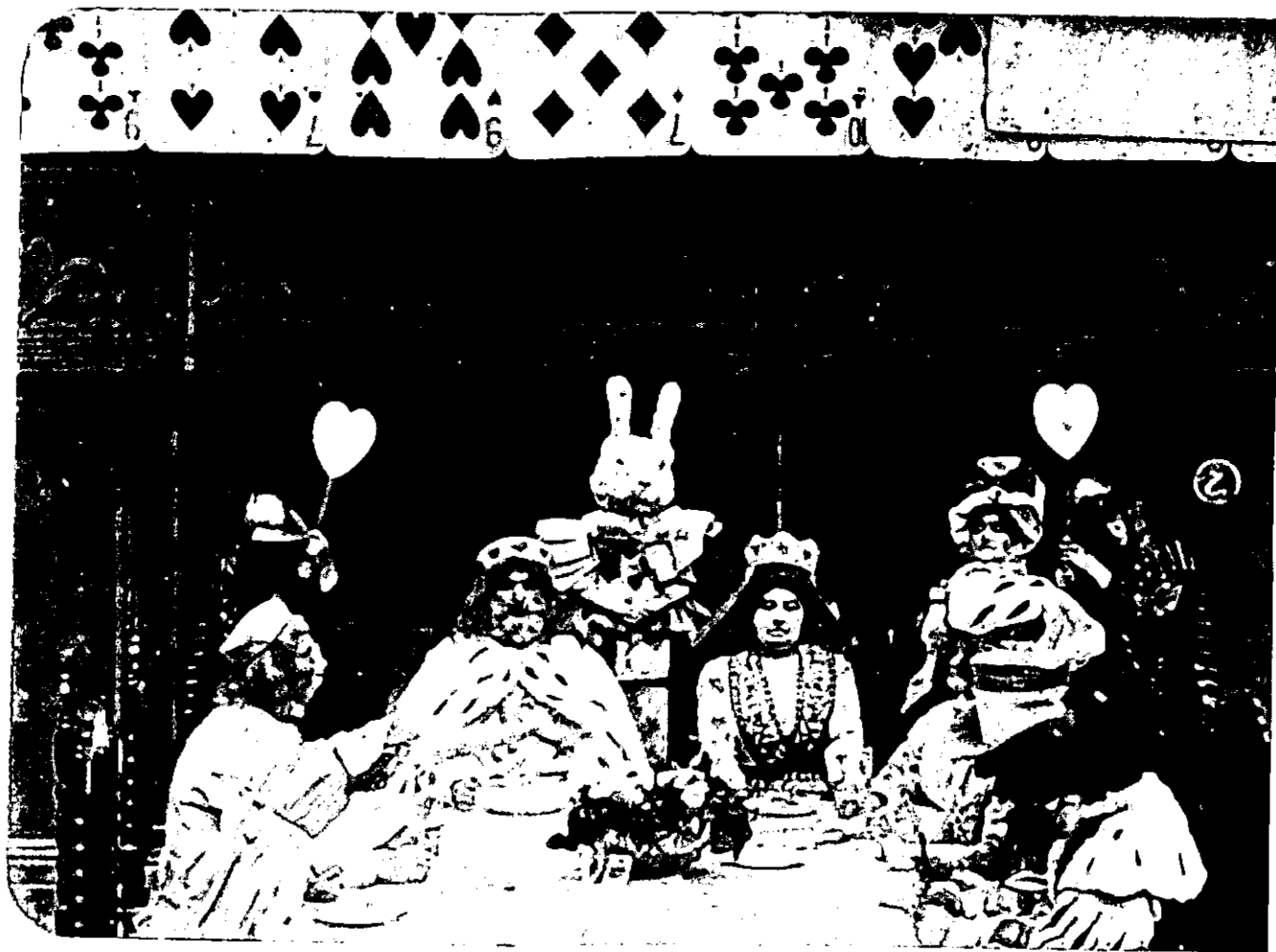
Fig. 4—1910 Edison Alice party

line of playing cards. The music was composed by Irving Berlin. Reviewers singled out the Alice sequence for special praise.