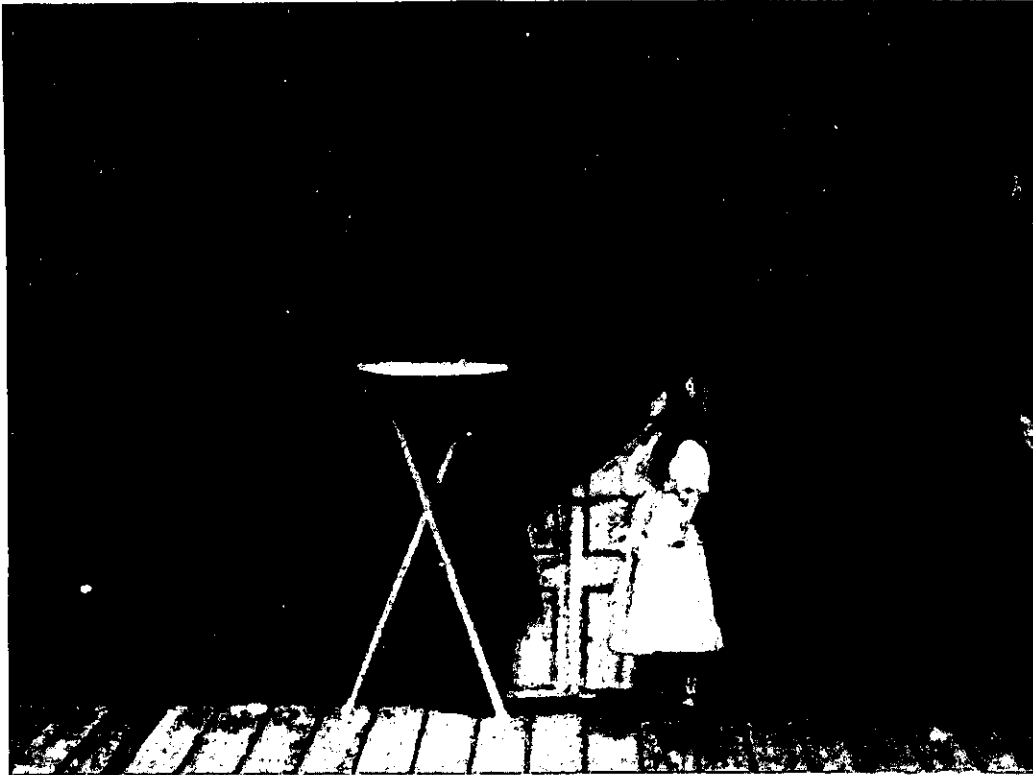
Figs. 1 and 2 - 1903 Alice changing size in the hall of doors