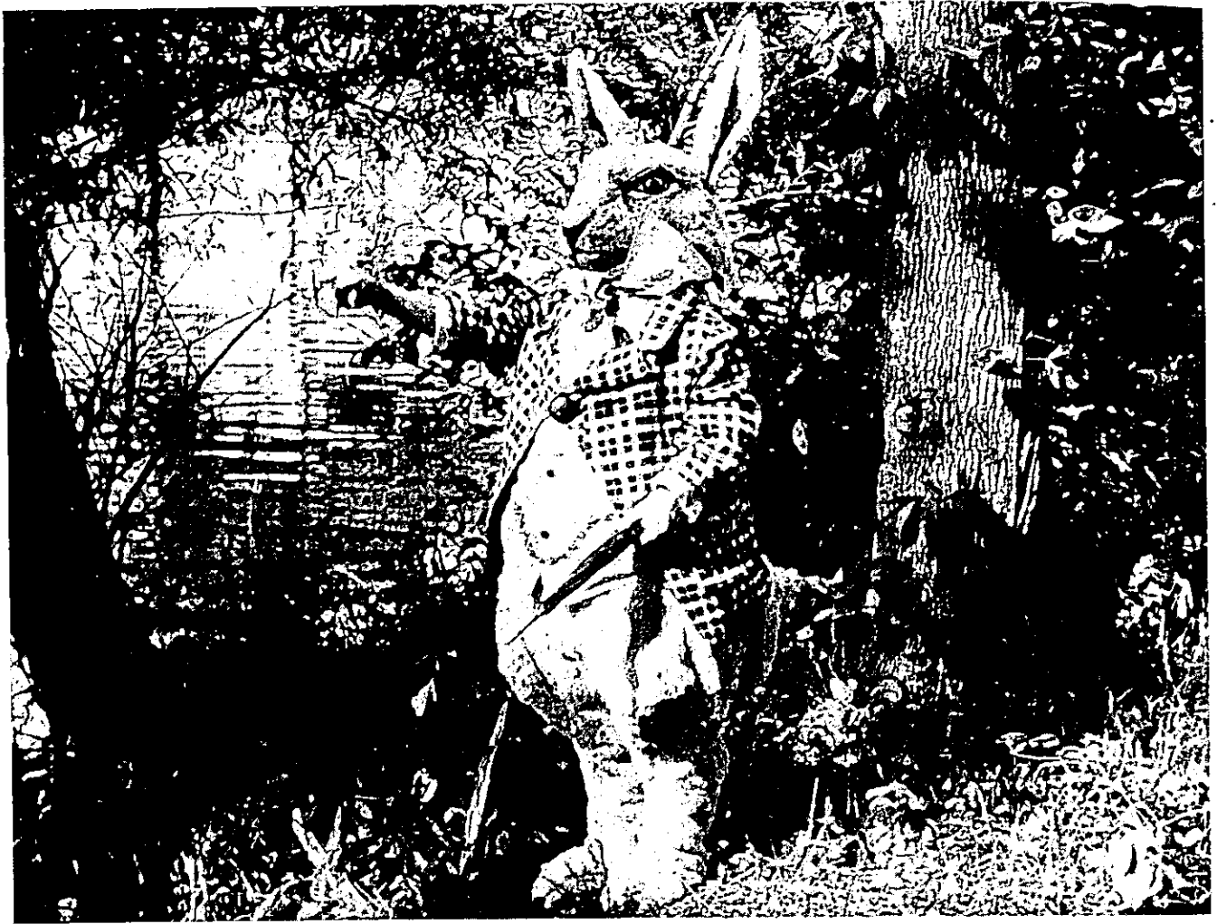
Fig. 5—1915 White Rabbit

major feats called for in the books, the film also presents minor ones such as “drink me” bottles that suddenly appear, a Cheshire Cat that surprisingly leaves not only his grin but also his ears and eyes, a White Queen changing into a sheep, and a leg of mutton that is mobile and articulate. Befitting a Hollywood spectacle, live flamingos are used as croquet mallets.