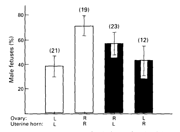
Fig. 2. Percentage (mean \pm SEM) of male fetuses found in left (L) and right (R) uterine horns of females assigned to ( \Box ) control and ( \blacksquare ) experimental groups. The number of uterine horns contributing fetuses to each group is indicated in brackets above the bars.

than in their left, while females in the experimental group (those that had tissue from both left and right ovaries placed in the contralateral ovarian capsule) gestated a greater proportion of male fetuses in their left uterine horns than in their right (Fig. 2).