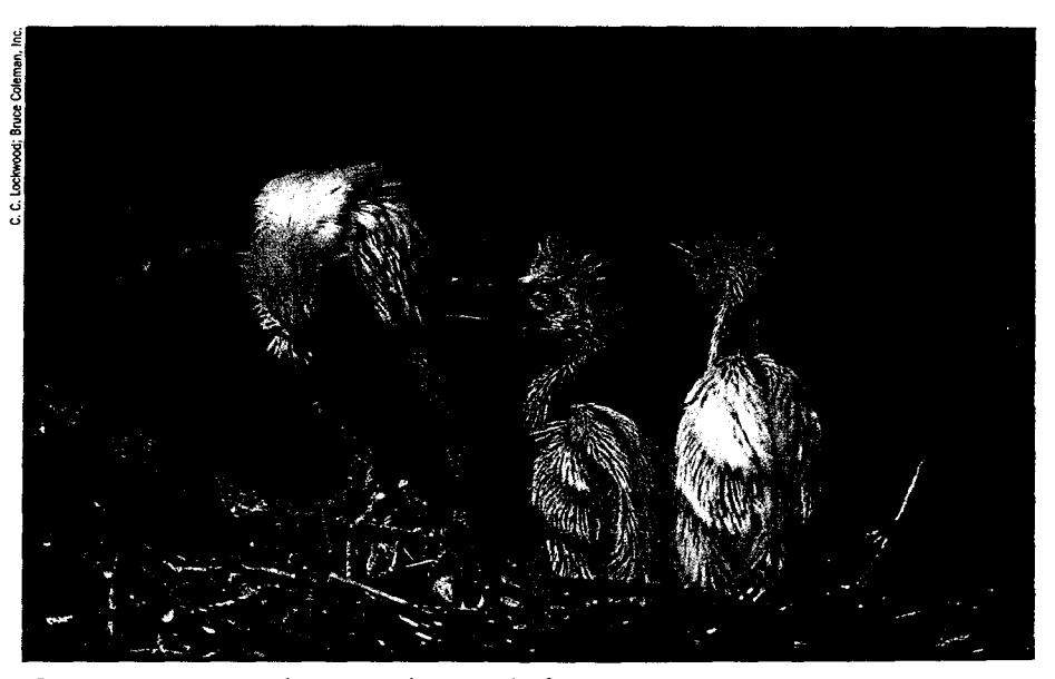
Competition among cattle egret nestlings can be fierce.

After hatching, nestlings of many species compete for food. Often, competition in the first few days is based on which nestling can beg most voraciously and stretch its neck closest to the food. As they grow, bigger nestlings may shove or aggressively peck at their smaller siblings. To the casual observer, the mother often appears indifferent to these squabbles, seldom attempting to make sure the "underbird" gets a fair share of the food. In fact, some of her actions—including the timing of