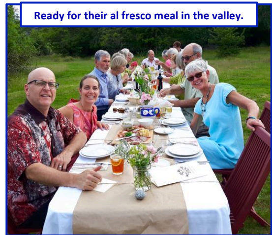
Ready for their al fresco meal in the valley.