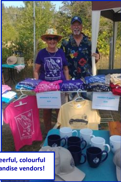
Our cheerful, colourful merchandise vendors!