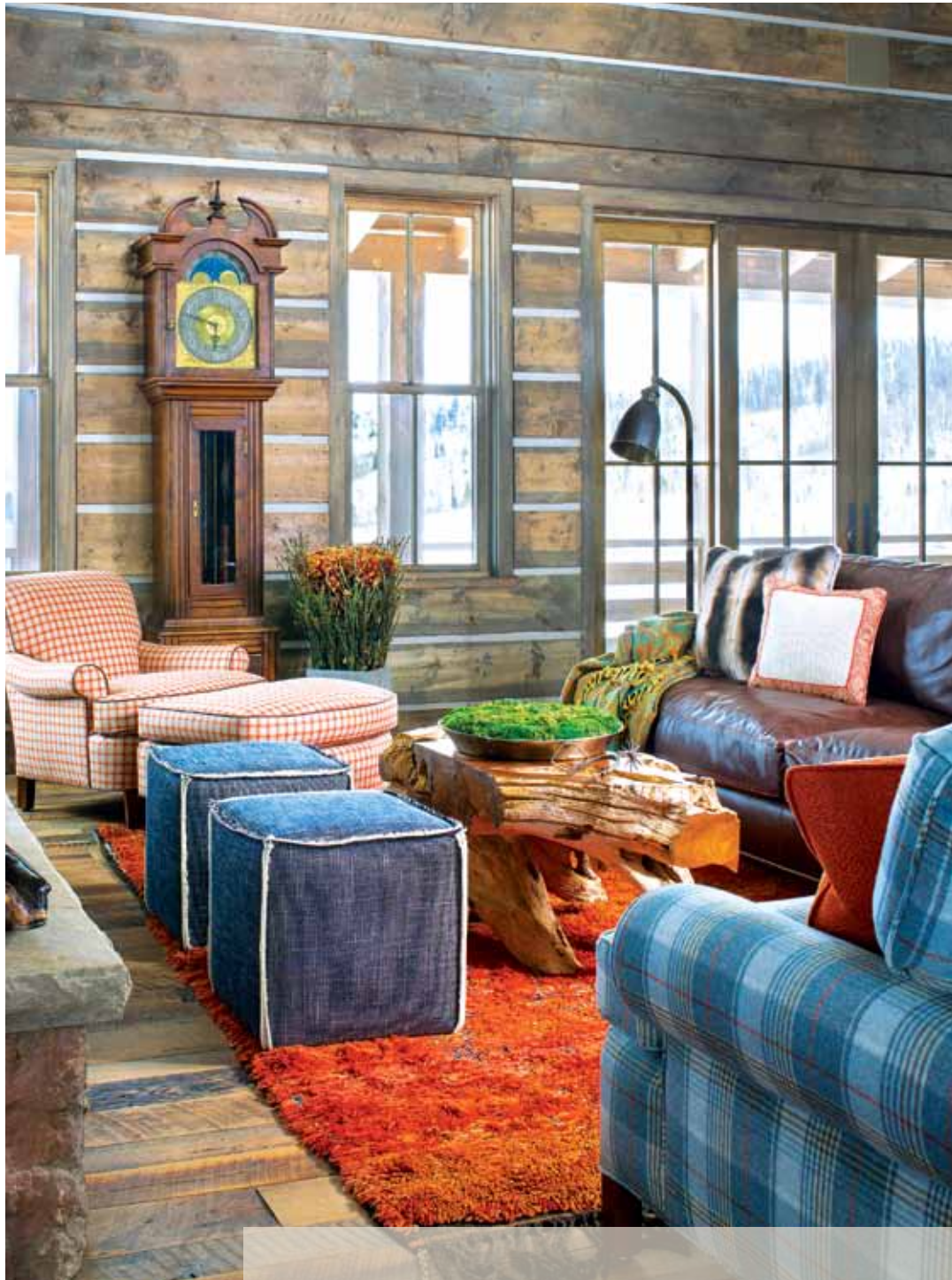
ABOVE: For the inviting living area, Kaufman had custom ottomans made from raw-edged linen that resembles denim; the Atlantis coffee table by Groovystuff is crafted from a petrified tree root. The Moroccan rug is from Artisan Rug Gallery, and the grandfather clock is a family heirloom. RIGHT: The kitchen features custom cabinetry from New Mountain Design, a vintage porcelain sink and an oversized work island. The Manuscript pendant lights overhead are by Currey & Company, and the bar stools are from Restoration Hardware.

“THERE’S NOT AN INCH OF DRYWALL IN THIS HOUSE. YOU JUST CAN’T REPLICATE THIS LOOK WITH NEW MATERIALS.”