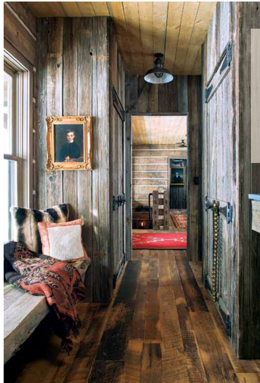
FACING PAGE, TOP: A Pearson sectional sofa is a comfortable landing spot in the entertainment area; it faces a Clint coffee table from Arteriors Home. Oilfield Slang created the vintage pipe sconces. FACING PAGE, BOTTOM: Kaufman incorporated authentic details like tin ceilings and handmade clay brick flooring throughout the home. LEFT: A built-in window seat is a cozy vantage point for watching wildlife. BELOW: The powder-room walls are covered in colorful vintage license plates, and the sink is a repurposed 1930s European fountain.