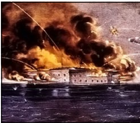
Fort Sumter is Fired Upon April 1861

As the article in The New York Times read the next day, “The ball has opened. War is inaugurated.”