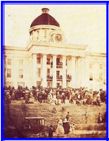
Davis is sworn in at the Alabama State Capitol February 1861

On Feb. 9, delegates to the Confederate convention named Jefferson Davis the provisional president of the Confederate States of America and selected Alexander Stephens, both pro-Union and a friend of Abraham Lincoln, as vice-president.