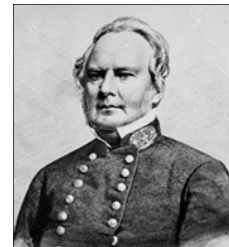
Maj. Gen. Sterling Price, CSA

On Sept. 10, Confederate forces led by Maj. Gen. Sterling Price evacuated Little Rock, Ark., after being pressured by troops under Union Maj. Gen. Frederick Steele.