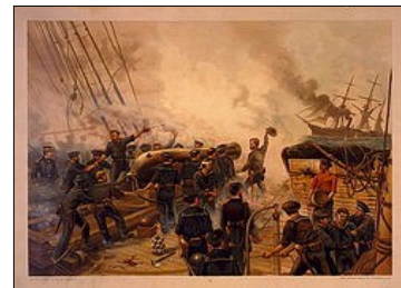
The Battle of Cherbourg

On June 19, the very successful Confederate commerce raider CSS Alabama was sunk by the USS Kearsage off the coast of Cherbourg, France.