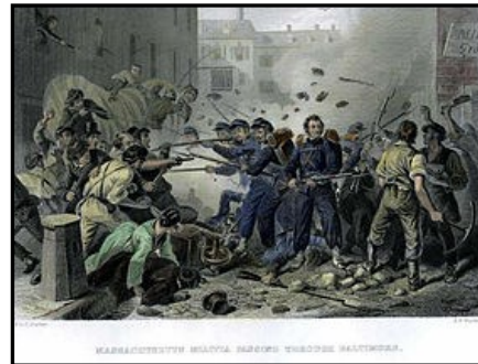
6th Mass Attacked in Baltimore

Massachusetts provided 68 regiments of infantry, two of which were formed with black men, along with five cavalry regiments and numerous artillery units.