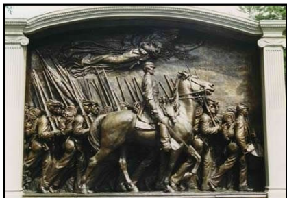
54th Mass Monument, Boston

About 150,000 men from Massachusetts served in the Union forces and nearly 14,000 of them were killed in battle or died of disease during the Civil War. Two regiments of colored infantry came from the state, including the famed 54th Massachusetts.