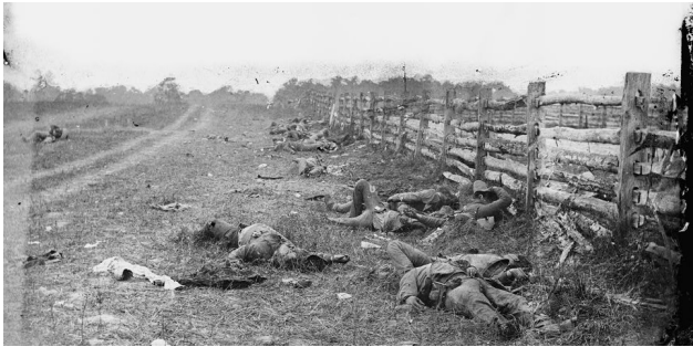
Confederate Dead by a Fence on the Hagerstown Road (Antietam, MD, September 1862)

It has been widely accepted that North Carolina contributed the most troops to the Confederate cause, estimated at more than 125,000, and Tar Heels suffered the greatest number of Confederate casualties in the Civil War, some 40,000 deaths. However, a state research historian says that casualty figure is more likely to be between 33,000 and 35,000.