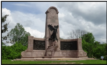
Missouri Monument, Vicksburg

In 1860, Missouri had a population of 1,182,012. Of that total, 114,931 were slaves. The state was of strategic importance, located in the center of the country on the Mississippi River. Although the state had dual governments, it was effectively in Union control after the August 1861 battle of Wilson's Creek.