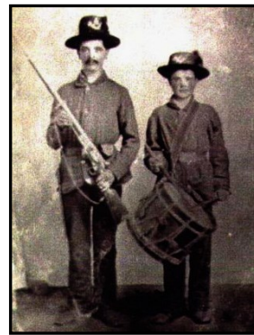
Germans with the 17th Missouri (U.S.)

About 110,000 men from the Iron Mountain State served in Union forces and at least 40,000 fought for the Confederacy. Missouri provided 64 volunteer infantry regiments, 30 cavalry regiments, six artillery batteries, and 30 independent units to the Union cause. Germans represented about one-third of Missourians who fought for the Federal government. Some 27,000 soldiers and civilians from the state died during the Civil War.