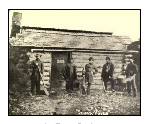
1st Texas Regiment

Between 70,000 and 90,000 Texans fought for the Confederacy, many of which served in cavalry units. Between 2,000 and 3,000 men from the state, some of which were former slaves, served in the Union forces. Texas regiments fought in every major battle during the Civil War.