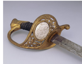
Hilt Detail on Pettigrew’s Sword

On June 30, 1863, Pettigrew led his men eastward from Cashtown, PA, toward Gettysburg, where they heard reports of Union cavalry nearby. His brigade was heavily engaged in the fighting on July 1 west of Gettysburg along McPherson’s Ridge, and when Maj. Gen. Henry Heth was wounded, Pettigrew assumed command of Heth’s Division, as its senior brigadier. The division remained in reserve on July 2, but was assigned a key part in the assault planned for the next day.