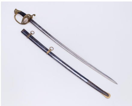
Pettigrew’s Sword and Scabbard

Pettigrew went to Virginia in 1861 as a private in the Hampton Legion but soon was named Colonel of the 22nd North Carolina Regiment. During the Peninsula Campaign, Pettigrew led a mixed brigade and was badly wounded at Seven Pines; although he was reported as killed, he was captured and nursed back to health by the Federals. He was exchanged during the summer and was given command of a brigade in the Old North State, where he served until the spring of 1863, when he and his men joined Robert E. Lee’s Army of Northern Virginia.