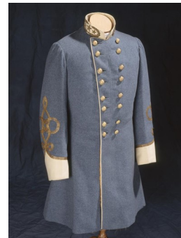
Pettigrew’s Frock Coat

Heth’s Division – under Pettigrew – formed the left wing of Lt. Gen. James Longstreet’s assault column on July 3, with George Pickett’s Virginians on the right and a portion of Dorsey Pender’s “Light Division” in support. The division sustained massive losses in the Pickett-Pettigrew assault, and the ANV withdrew the following evening.