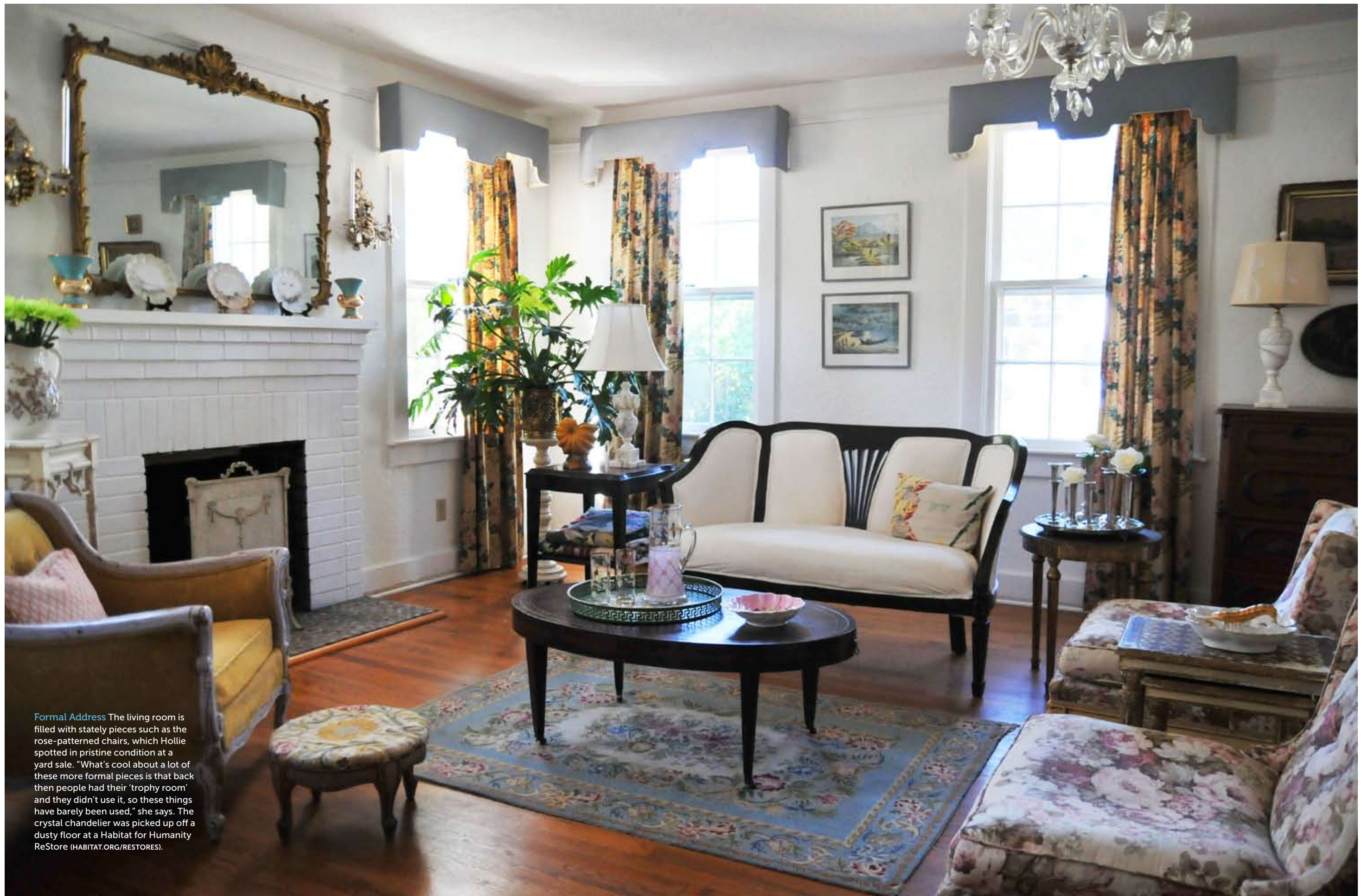
Formal Address The living room is filled with stately pieces such as the rose-patterned chairs, which Hollie spotted in pristine condition at a yard sale. "What's cool about a lot of these more formal pieces is that back then people had their 'trophy room' and they didn't use it, so these things have barely been used," she says. The crystal chandelier was picked up off a dusty floor at a Habitat for Humanity ReStore. ( HABITAT.ORG/RESTORES ).