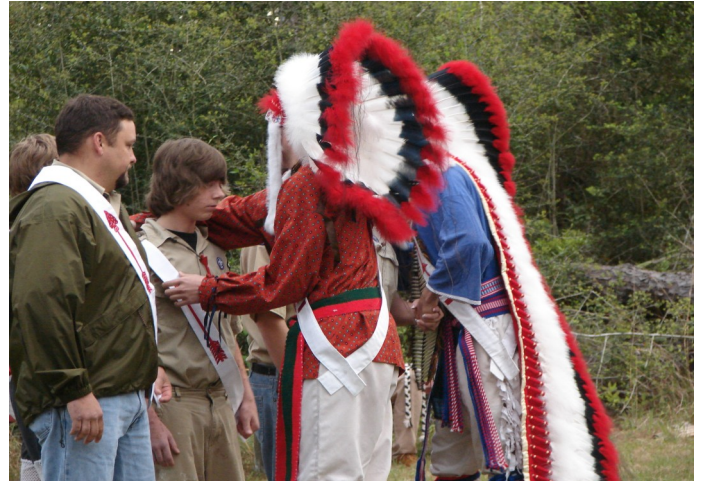
(Above) New Arrowmen receive the OA Handclasp and Admonition from Allowat Sakima, the Mighty Chief, and their Ordeal sash from Nutiket, the Guard, at the Spring Ordeal.