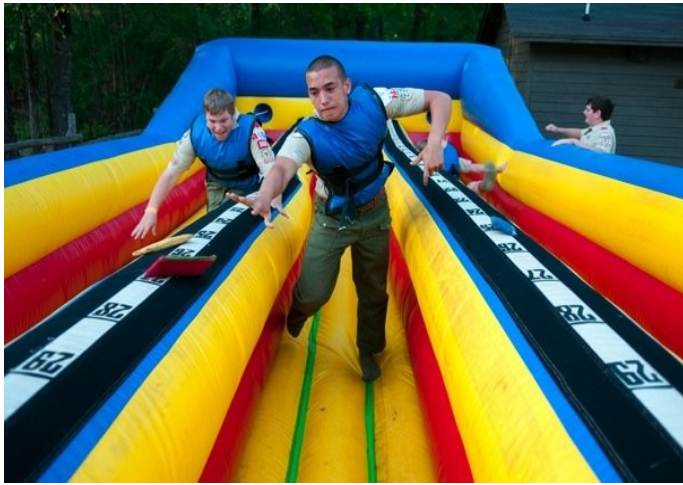
(Above) Arrowmen enjoying the inflatable bungee run at the Founders Festival on Saturday night of Conclave.