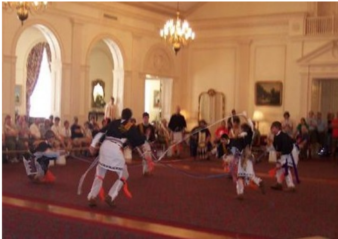
(Above) The Quelqueshoe Lodge Dance Team performs Belt Dance in the Group Dance competition at the 2008 SR-2 Conclave on July 26th at Baylor University.