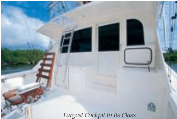
Largest Cockpit In Its Class