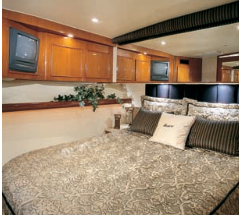
▲ Master Stateroom (above): The master suite in the Plan B version (shown here) places the cabin amidship where there is less noise and more comfort underway. The queen-size berth is accessible from three sides and features stowage below. The hanging wardrobe locker is lined with cedar and illuminates upon opening.