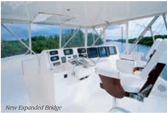
New Expanded Bridge