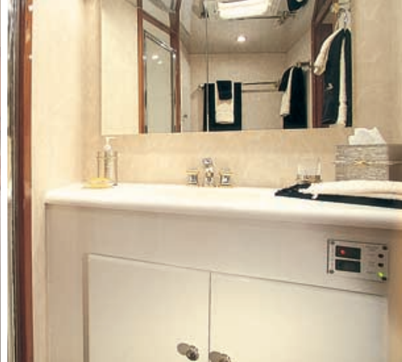
▲ Master Head (above): Accessed through the owner's stateroom, the master head offers the privacy and comfort you would expect to find aboard a quality yacht, including a fully enclosed stall shower, oversized vanity, medicine cabinet with mirror, AC with reverse cycle heat and opening overhead hatch.