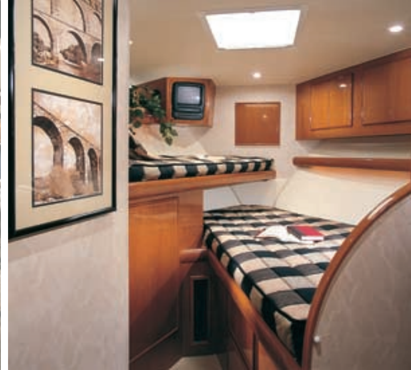
▲ Forward Stateroom (above): An optional full-size lower and single upper berth in the forward stateroom adds extra convenience for guests and children (Plan B optional layout). Hull side cabinets and shelving, bullnose moldings and plush fabrics create an inviting atmosphere. There is private access to the head, and a washer and dryer abft the starboard berth.