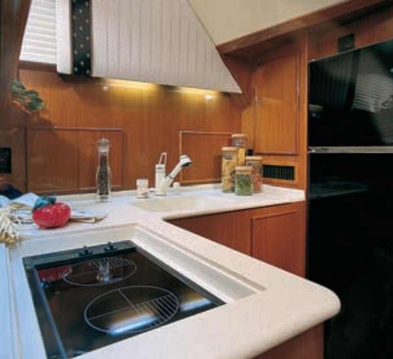
▲ Galley (above): Recessed cooktop is not only convenient, but made doubly practical with a removable cover that hides the appliance when not in use for an uninterrupted flow of Corian. The full-size refrigerator/freezer comes with a built-in ice cube maker. Indirect lighting casts a soft glow across the bookend matched joinery. Teak parquet floor is standard.