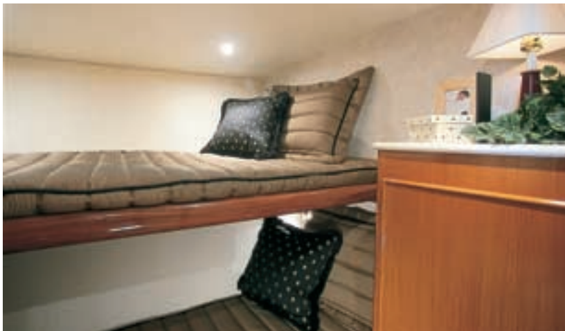
▲ Guest Stateroom (above): The portside guest stateroom features comfortable over and under bunks with generous drawer storage below and a large screened hatch overhead.

Note: Post reserves the right to make changes in design, equipment, layout and/or construction without notice.