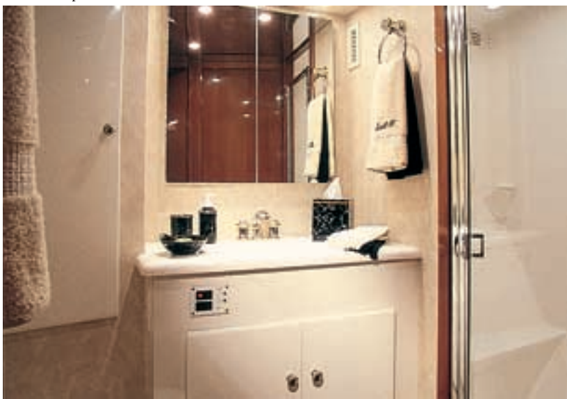
▼ Guest Head (below): Guest head has a fiberglass stall shower and seat. Molded countertops and vinyl flooring make clean-up a breeze. Teak and holly sole is an option.