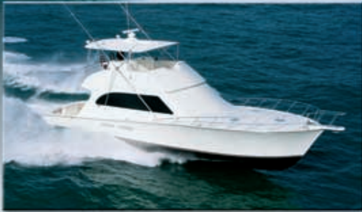
Superb Handling Characteristics In All Sea Conditions