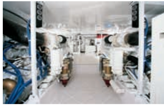
56 Engine Room