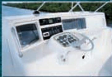
Centerline Helm Provides Excellent 360 Degree Visibility