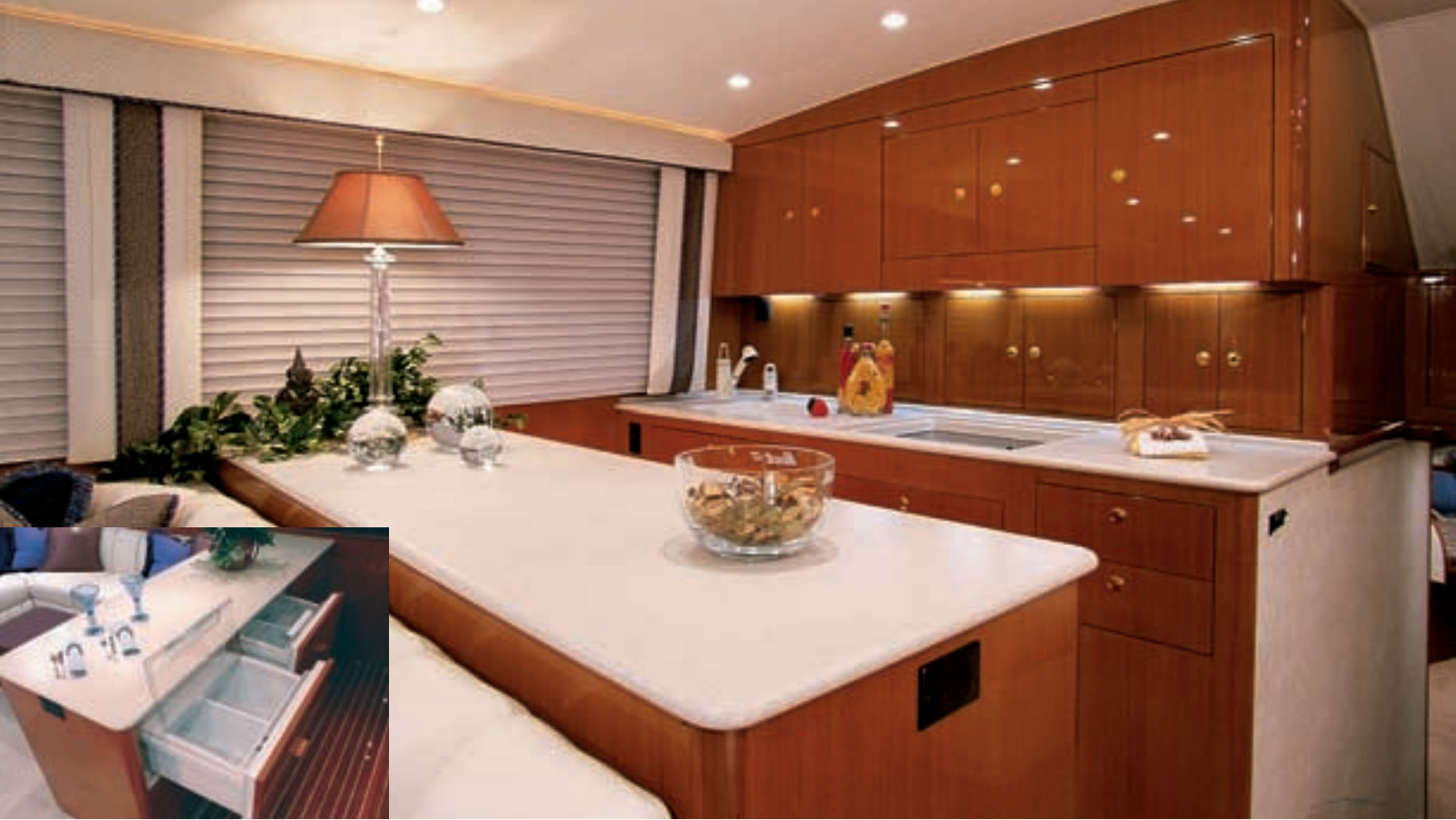
▲ Galley (above): The galley is outfitted with a Corian countertop, convection microwave and an electric cook top. An under counter refrigerator and freezer (shown with optional drawers) are located in the galley island to maximize space and convenience. Indirect lighting casts a soft glow across the bookend matched joinery. Teak parquet floor is standard.