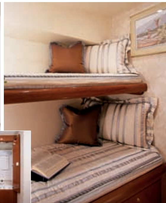
▲ Guest Stateroom (above): To starboard, the guest stateroom features upper and lower berths with drawers below and a deep hanging locker

Located on the companionway (to starboard), a washer/dryer is neatly tucked out of site.