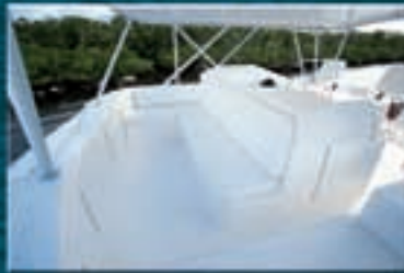
Spacious Forward Seating With Stowage Below