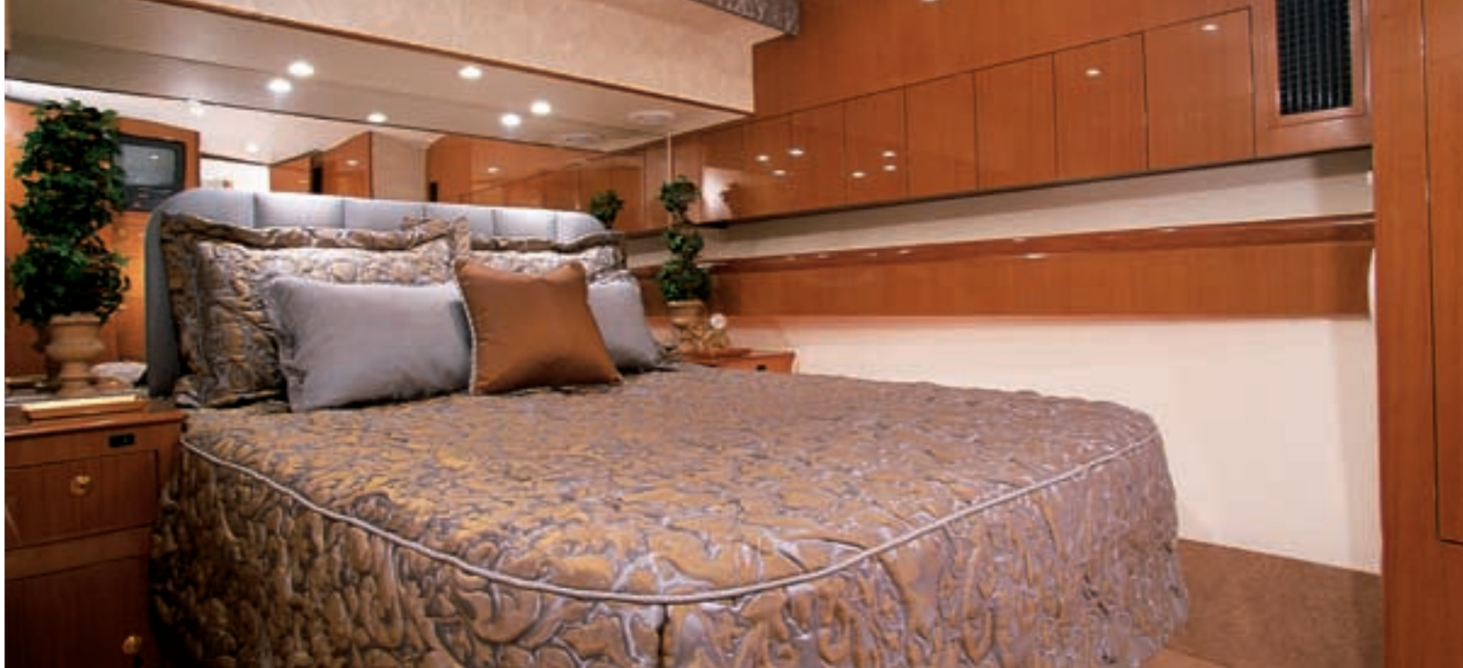
▲ Master Stateroom (above): The master stateroom with a queen-sized island bed is on the port side. Under berth stowage is complemented with a cedar-lined hanging locker and a wall of drawers that also includes a built-in television. A private head offers a molded countertop with a recessed sink and a fiberglass stall shower with seat and linen cabinet.