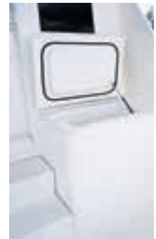
Top Loading Bait Freezer