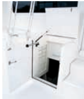
Cockpit Engine Room Access