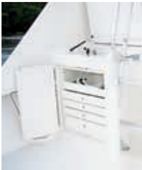
Tackle Locker & Rigging Station