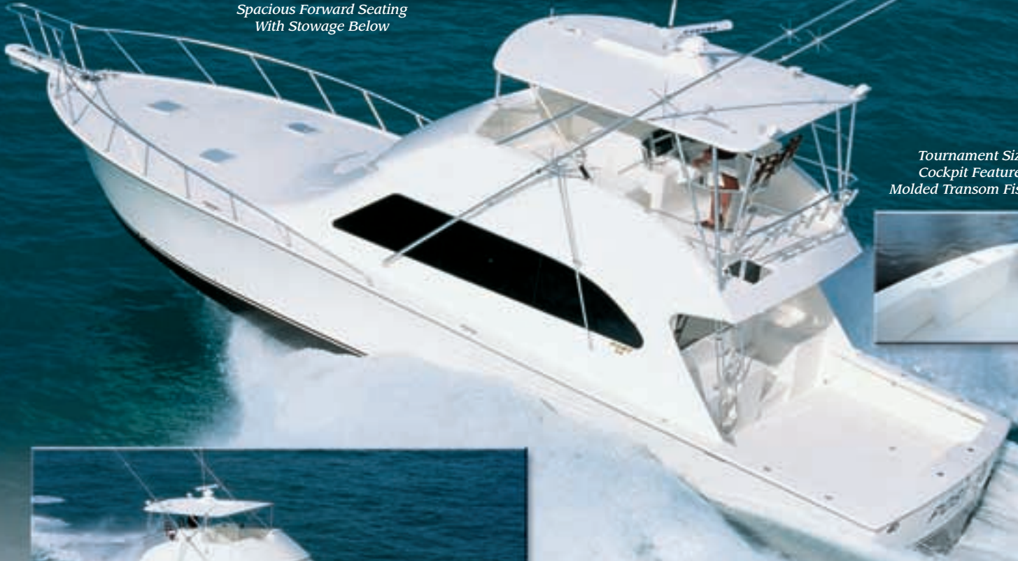
Tournament Size Cockpit Features Molded Transom Fishwell