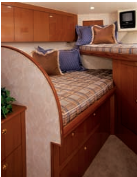
▲ Forward Stateroom (above): Has a lower double berth and a single upper berth with cedar-lined hanging lockers, an arrangement that is attractive to long-range fishermen and cruising couples. This stateroom has private access to the second head, which also can be reached from the offset companionway.