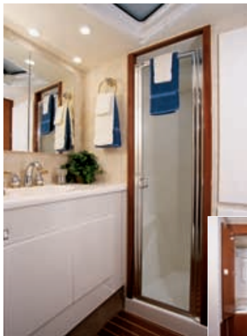
▲ Master Head (above): Accessed through the owner's stateroom.

Located on the companionway (to starboard), a washer/dryer is neatly tucked out of site.