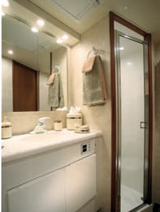
▲ Head (above): The 42's head features a full stall shower w/seat, a vanity with a one-piece molded top and sink, medicine cabinet w/mirror, air conditioning w/reverse cycle heat, opaque overhead hatch with screen & shade, and an electric head with holding tank.