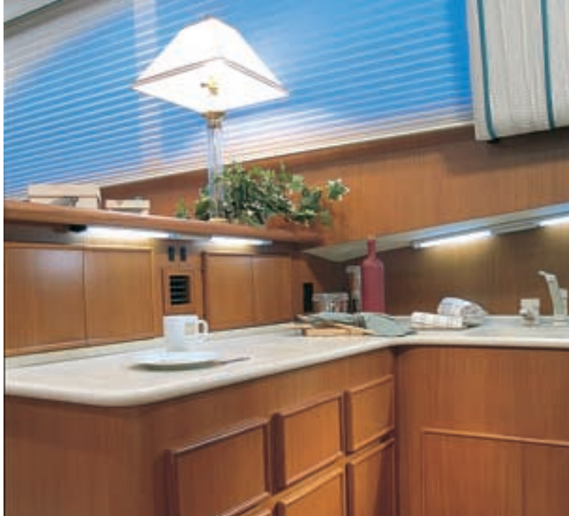
▲ Galley (above): The step-down, U-shaped galley is a lesson in efficiency. Corian countertops and a teak parquet sole frame an abundance of functional cabinets and drawers capable of holding everything needed for extended cruising. Under the galley sole, another huge, well-lit, carpeted compartment provides added stowage.