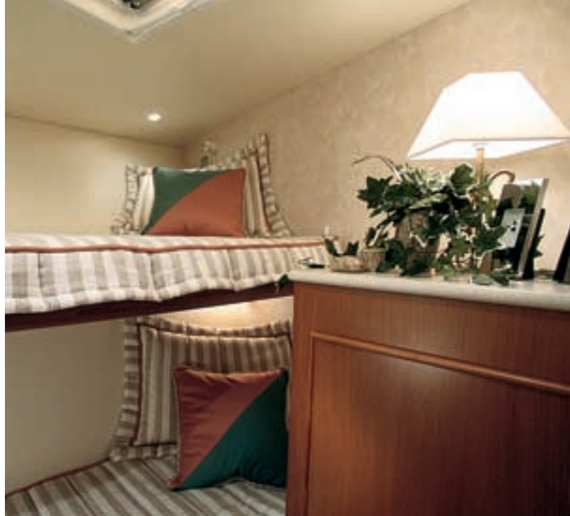
▲ Guest Stateroom (above): This air conditioned cabin with its reverse cycle heat and overhead hatch features two comfortable 6' berths with reading lights and ample drawer storage below. A spacious hanging locker provides additional storage space for clothing and gear.