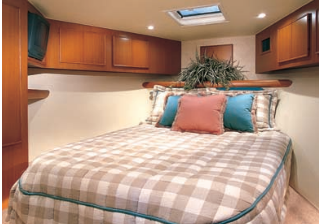
▲ Master Stateroom (above): The centerpiece of this master suite is a queen-size berth surrounded by hand-finished overhead cabinetry and cedar-lined hanging lockers with additional storage below. Other features include separate climate control, an opaque deck hatch with screen and blackout shade, reading lights and floor lighting.