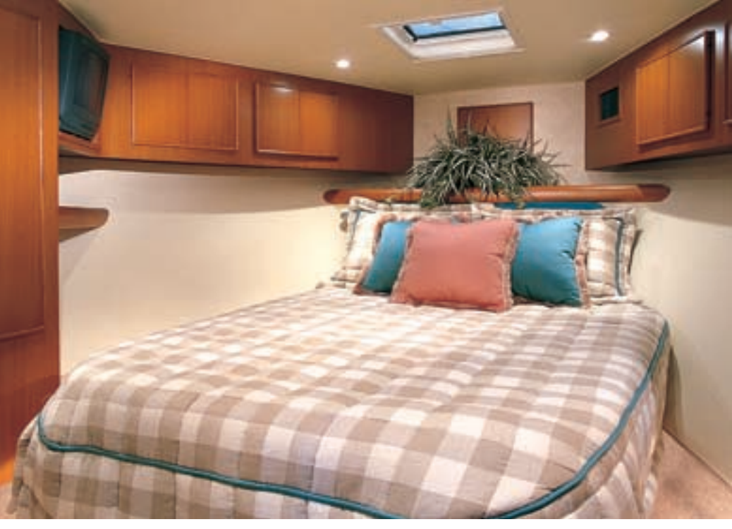
▲ Master Stateroom (above): The centerpiece of this master suite is a queen-size berth surrounded by hand-finished overhead cabinetry and cedar-lined hanging lockers with additional storage below. Other features include separate climate control, an opaque deck hatch with screen and blackout shade, reading lights and floor lighting.

Note: Post reserves the right to make changes in design, equipment, layout and/or construction without notice.