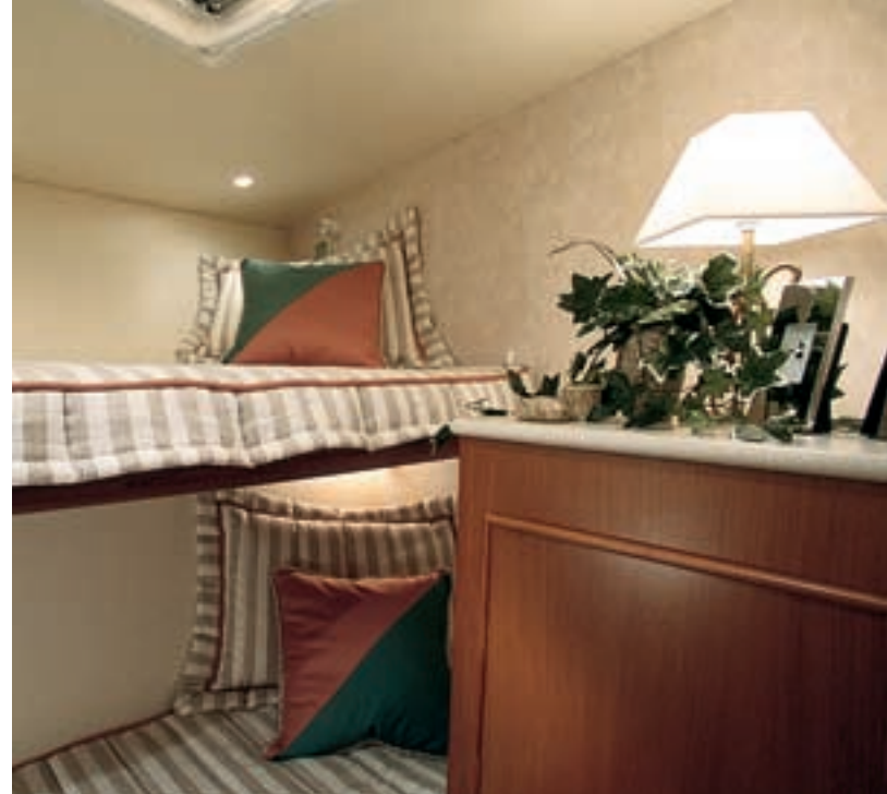
▲ Guest Stateroom (above): This air conditioned cabin with its reverse cycle heat and overhead hatch features two comfortable 6' berths with reading lights and ample drawer storage below. A spacious hanging locker provides additional storage space for clothing and gear.