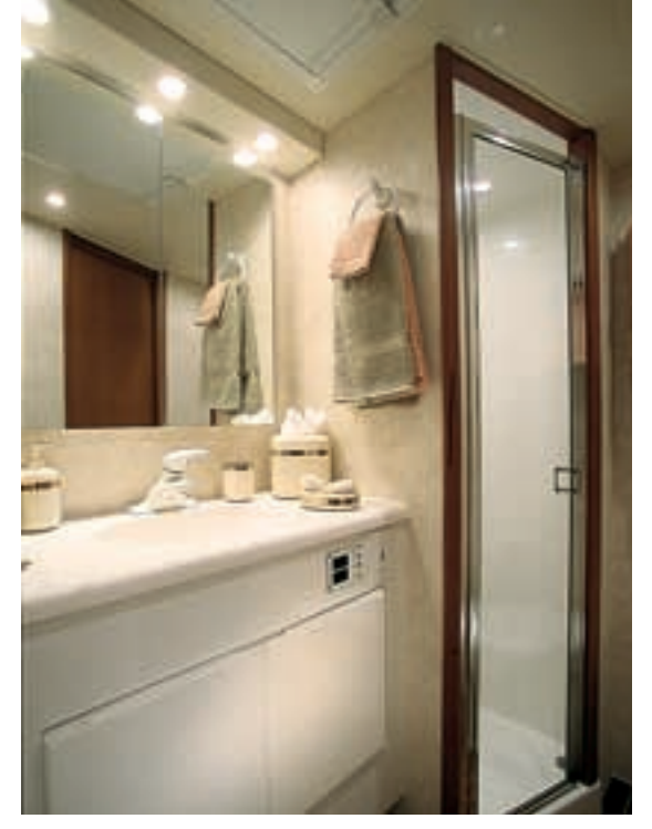
▲ Head (above): The 42's head features a full stall shower w/seat, a vanity with a one-piece molded top and sink, medicine cabinet w/mirror, air conditioning w/reverse cycle heat, opaque overhead hatch with screen & shade, and an electric head with holding tank.

Displaying The Same Meticulous Attention To Detail Found On All Post Yachts, The 42's Interior Rivals Anything In Its Class.