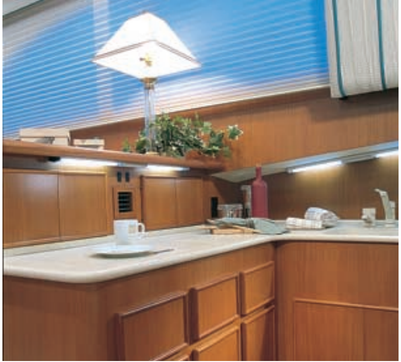
▲ Galley (above): The step-down, U-shaped galley is a lesson in efficiency. Corian countertops and a teak parquet sole frame an abundance of functional cabinets and drawers capable of holding everything needed for extended cruising. Under the galley sole, another huge, well-lit, carpeted compartment provides added stowage.