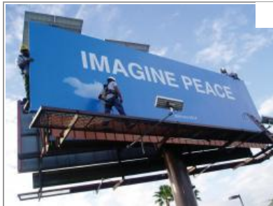
Workers install Yoko Ono's message of peace along U.S. 41.

"You see, when you're mending the globe, you're thinking of mending the world," Ms. Ono says. "That's the catch. You're doing it."