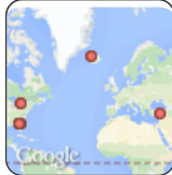
6 Points Mentioned