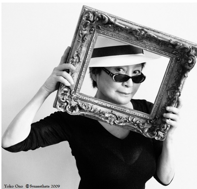
Yoko Ono