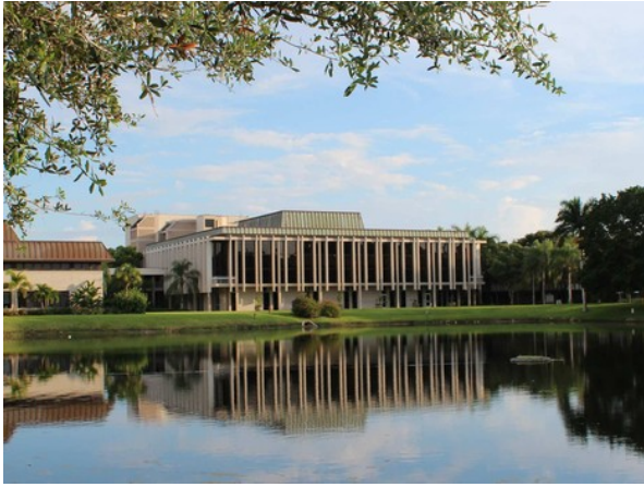
Tom Hall, 2013

8099 College Parkway, Fort Myers, FL 33919