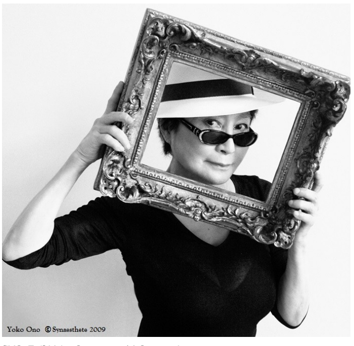
['YO-E5'] Yoko Ono 2009