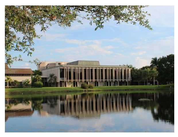
Tom Hall, 2013