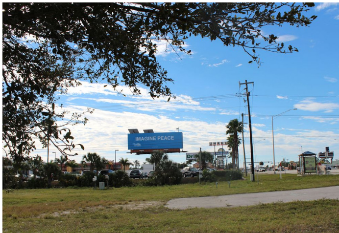
Tom Hall, 2014