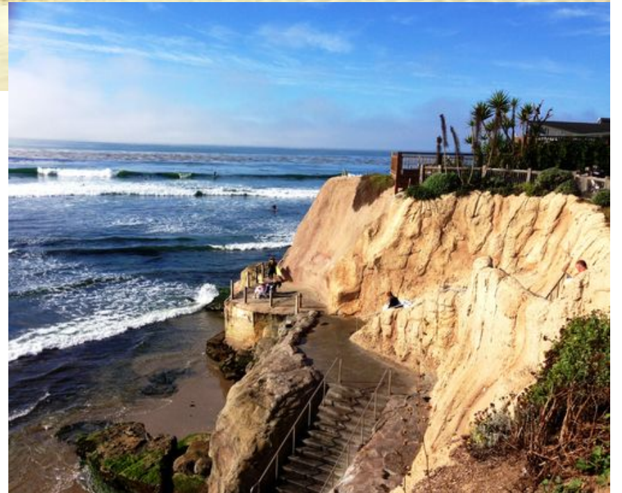
Contoured concrete tie-back seawall with beach access stairs at Pleasure Point, Santa Cruz