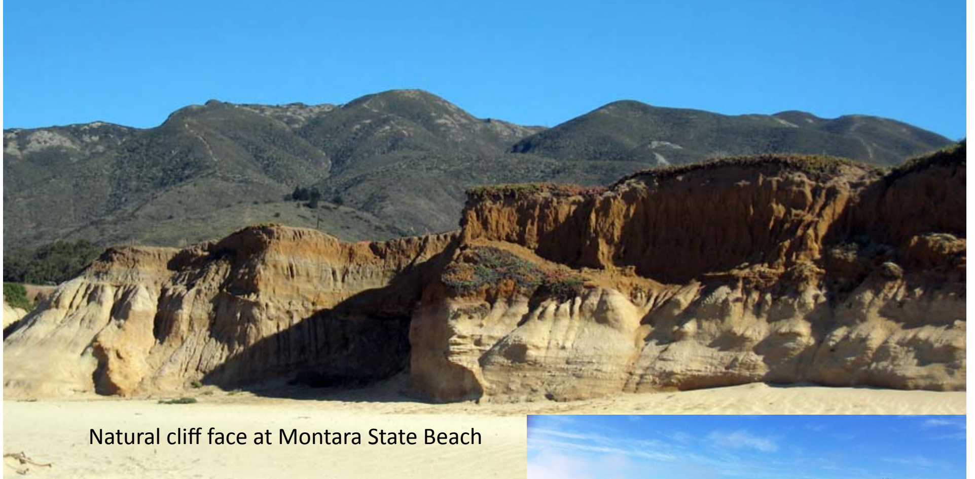
Natural cliff face at Montara State Beach