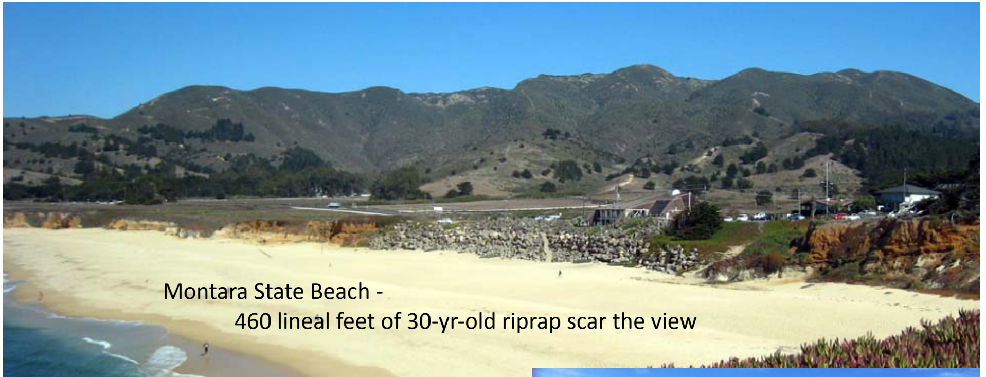
Montara State Beach - 460 lineal feet of 30-yr-old riprap scar the view

Instead of the planned repairs, how about replacing all the riprap with a contoured concrete tie-back seawall with beach access stairs to restore this otherwise pristine vista?