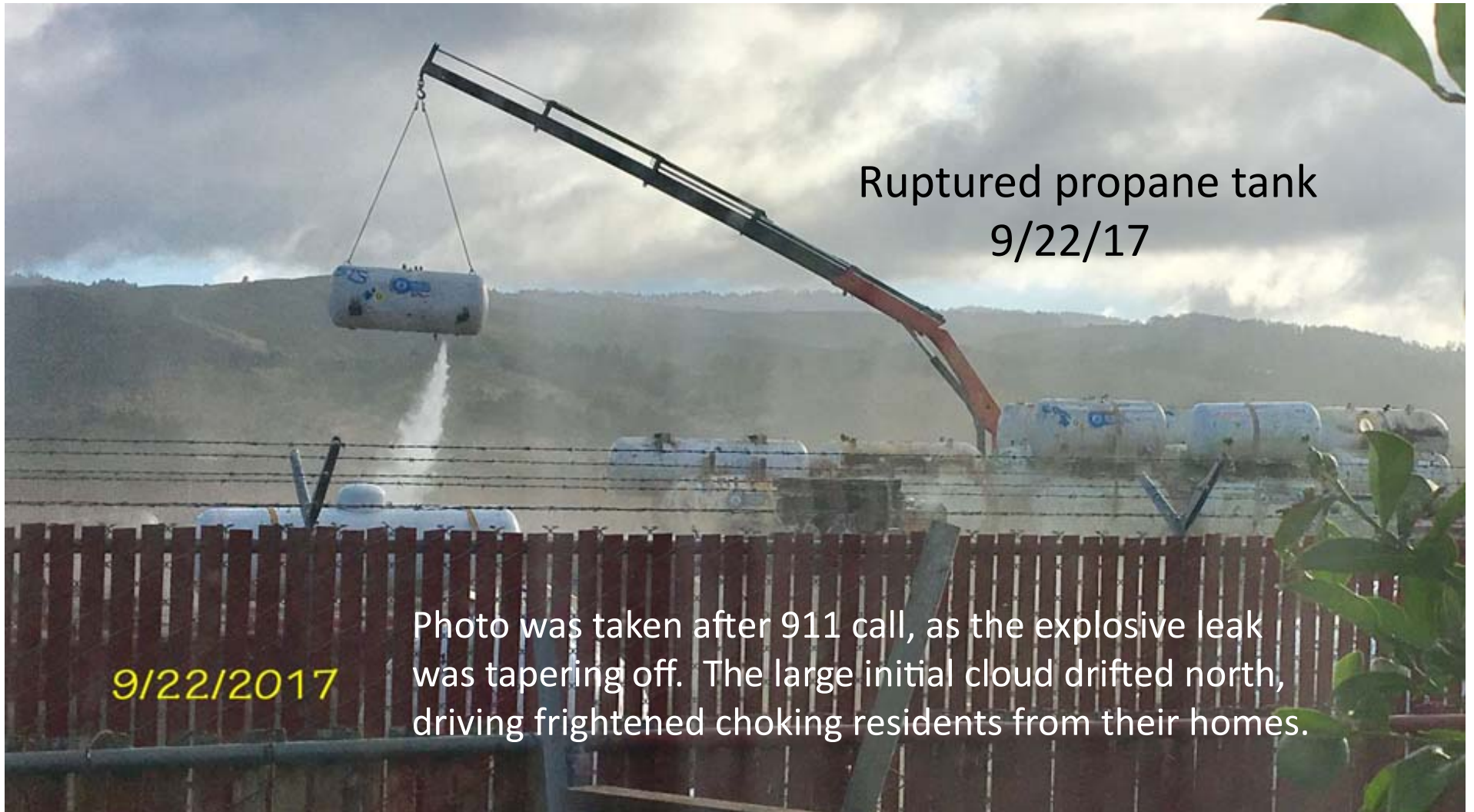
Ruptured propane tank 9/22/17