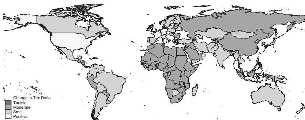
Fig. 3. Predicted long-term cumulative changes in tax revenue, resulting from a 1 SD counterfactual shock (increase) to Tunisia's foreign aid

solely to tax extraction. 9 We can see that the shock produces a relatively large initial effect, which increases in the first three time periods before moderating and gradually decreasing back to 0, or reaching the long-run equilibrium. The cumulative effect of these changes, of course, results in the aforementioned permanent 0.046 percent point increase in Greece's tax ratio . Although relatively small, it is important to keep in mind that this change is the isolated effect of the spatio-temporal feedback from the shock to just one neighboring country.