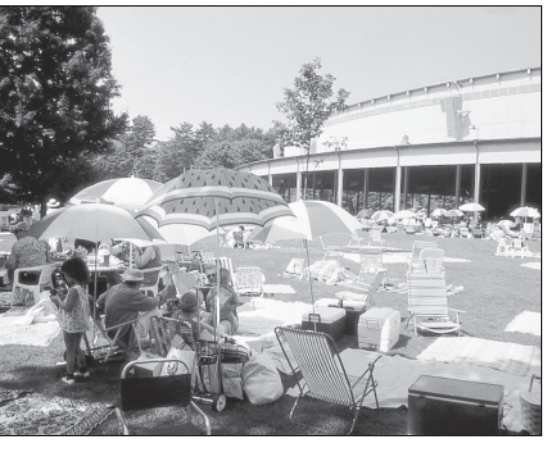
The Tanglewood Shed