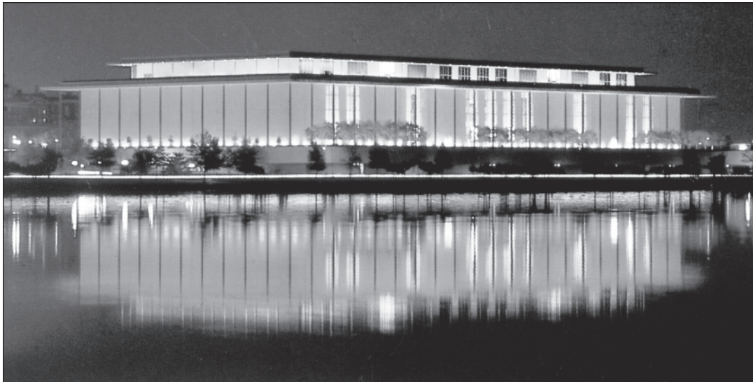
The Kennedy Center for the Performing Arts

BECAUSE OF THE UNUSUAL NUMBER OF EARLY REQUESTS FOR 'THE WASHINGTON RING', WE ARE INCLUDING THIS TOUR IN OUR CURRENT BROCHURE INSTEAD OF WAITING FOR OUR SPRING BROCHURE.