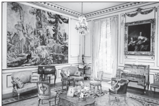
Marjorie Merriweather Post's Hillwood Estate; French Drawing Room and Japanese Garden