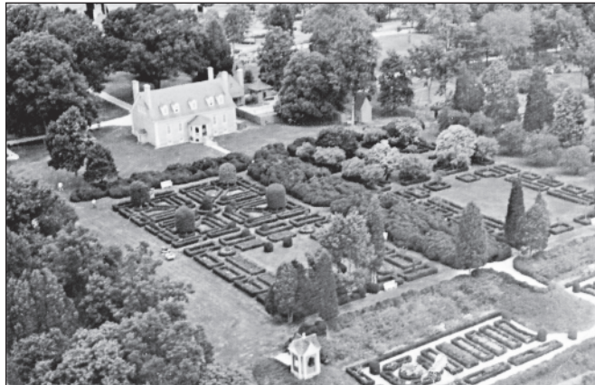
Gunstan Hall Plantation

At 6:00 pm on Wednesday, we will return to the Kennedy Center for the WNO presentation of DIE WALKÜRE .