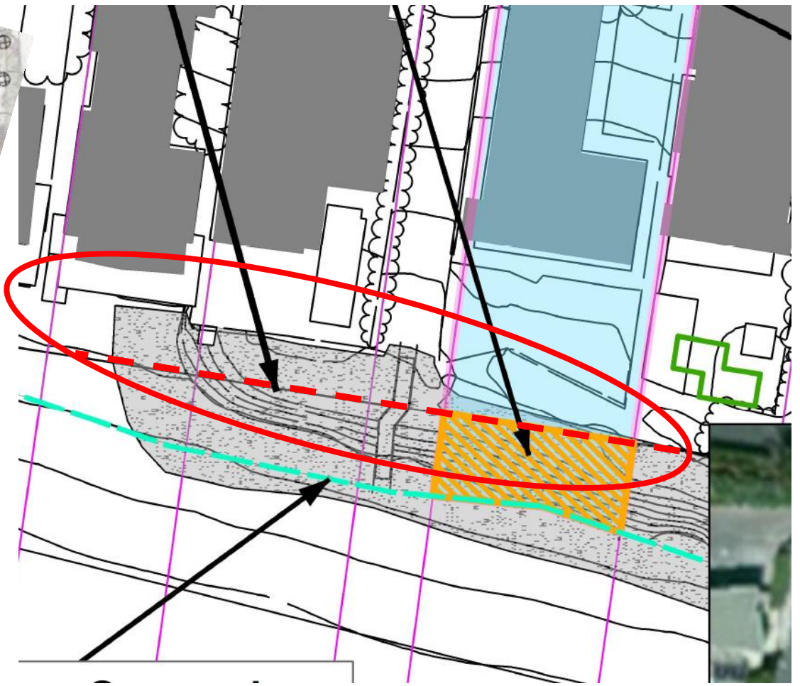
Schmitz & Associates – Dune “Encroachment Map” based on In-Progress Plans - March 2017