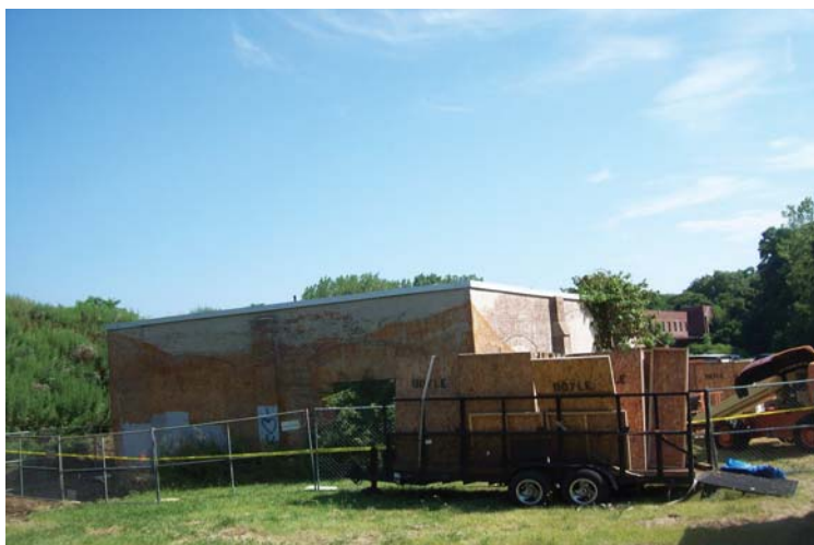
Building 6 (Power House Remains) - Pre-Asbestos Abatement Activities