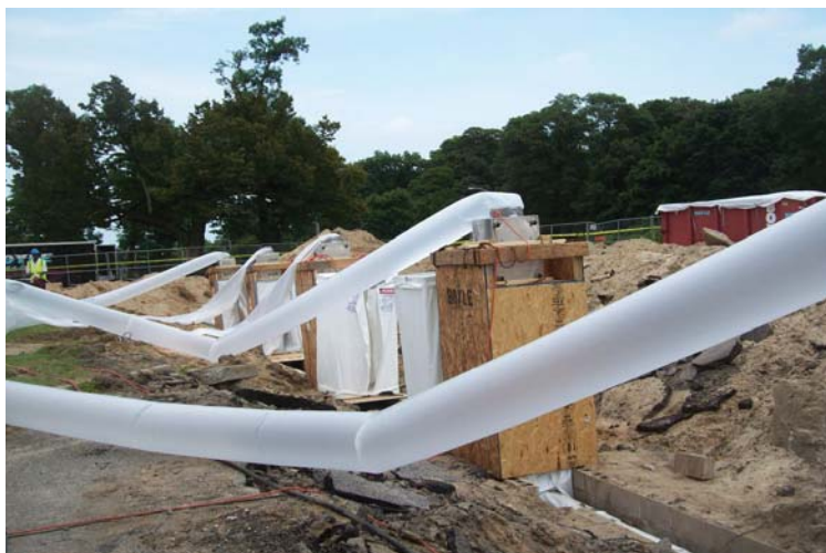
Building 56 (Community Store) - Manville Steam Tunnel Asbestos Abatement Activities