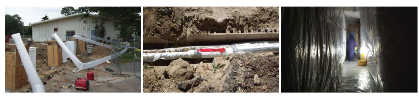
Building 56 (Community Store) – Asbestos Abatement Activities