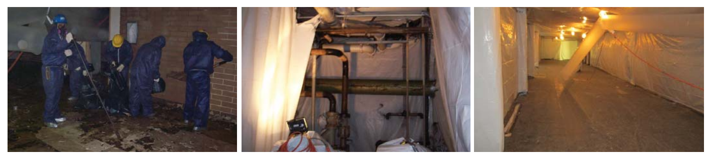
Building 23 (Buckman Day Treatment) – Asbestos Abatement Activities

Building 6 (Power House Remains) – Asbestos Abatement Activities