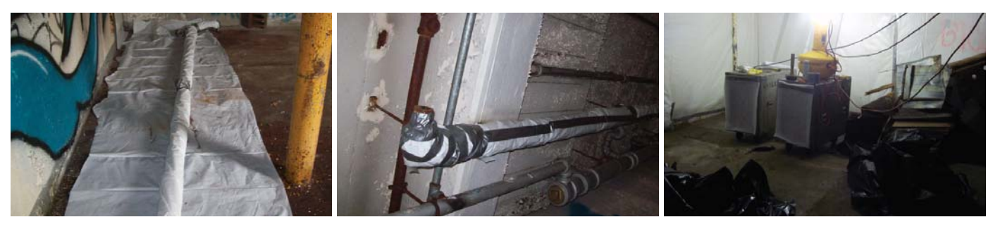
Building 47 (Dairy Barn) & Building 48 (Maintenance & Grounds) – Asbestos Abatement Activities