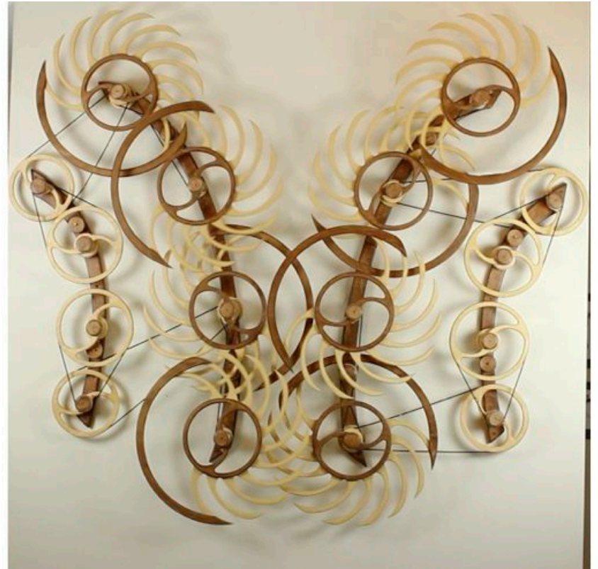
Double Cascade • Directions