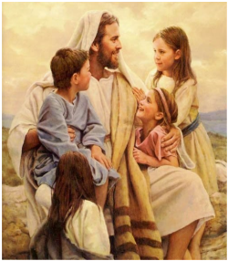
Jesus with the children.

Age for enrollment is 3 years old by September 1st; however, children must be both potty-trained and mature enough to remain in class and participate in the activities with the other children.