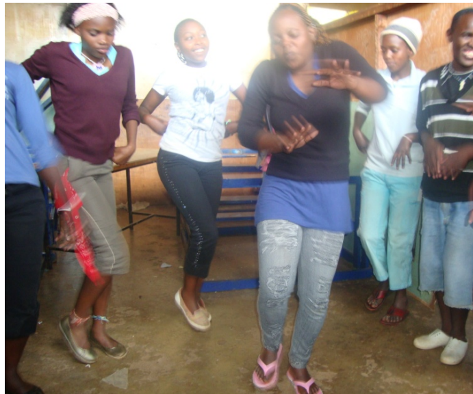
My passion: dancing

I was an active member in the Document and Communication Project at MMH during December holiday. My duty involved research work, interviewing members of all the other four projects and to interpret and edit all the collected information.