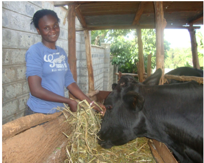
My hobbies: nature, our farm at MMH and running

Took part in the standard guided tour project at MMH during December holiday 2012.