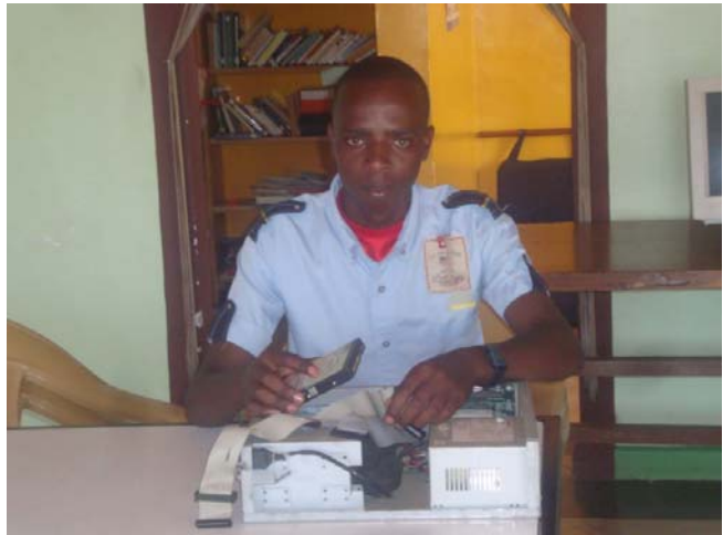
My hobby: all kinds of electrics and electronics

Participated in the shop upgrade project at MMH during December holiday. My task involved painting and repairing among others.