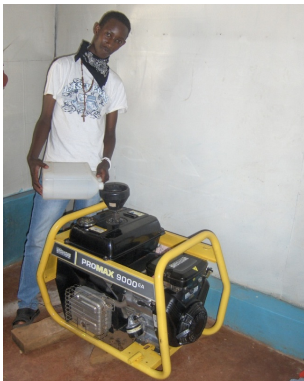
My hobby: all technical issues at MMH

I have learnt that we need one another because no man is an island. That dedication and commitment gives the expected results.