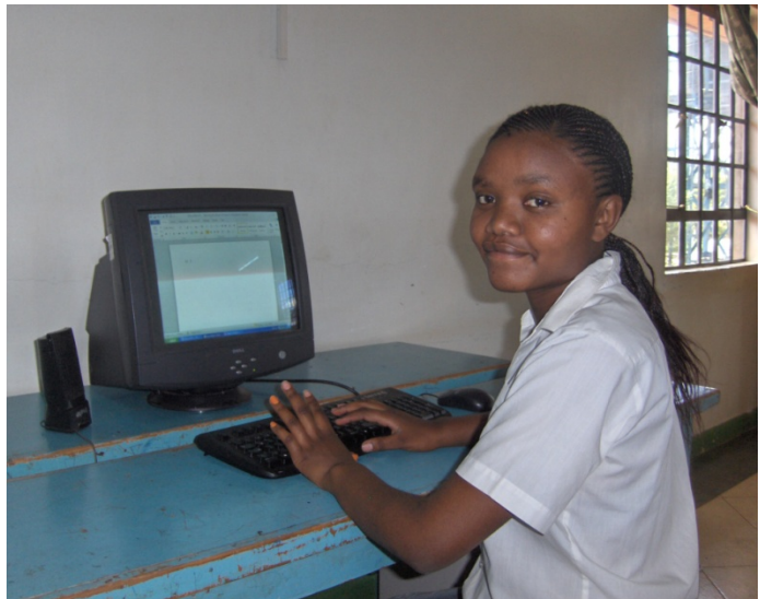
My hobbies: computer work and singing

I actively took part in the Shop upgrade project at MMH during December holiday. I have been responsible for the budget and the project calendar.