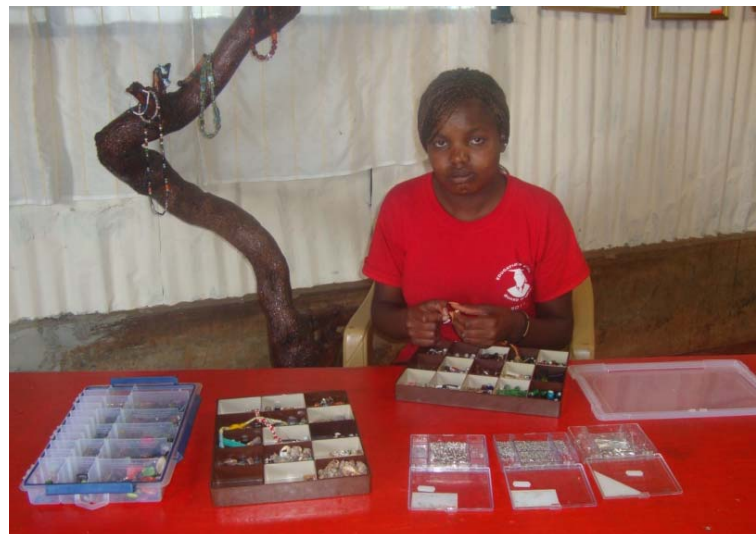
My hobbies: doing handicrafts, singing and dancing

At MMH I have participated in the Summer Camp on "How to manage your finance" Workshop. I participated in the MMH Shop upgrading project as a team leader and my task involved giving distributing tasks to members and ensuring that the work is done well. During December holiday I have served an internship at Gauff Engineering Company .