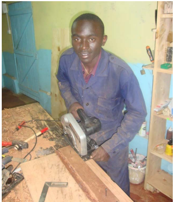
My passion: carpentry

I love carpentry with a passion. I have learnt that working together as a team helps because combined effort saves time and gives better results compared to an individual. Furthermore I realized the importance of detailed planning and budgeting for saving time and resources.