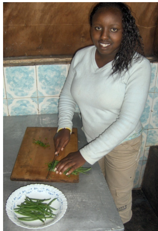
My passion: cooking, drawing, dancing

Being in the kitchen I have learnt to observe hygiene and being a time manager. I also learnt that for better results in all that I do, I must embrace the spirit of teamwork.