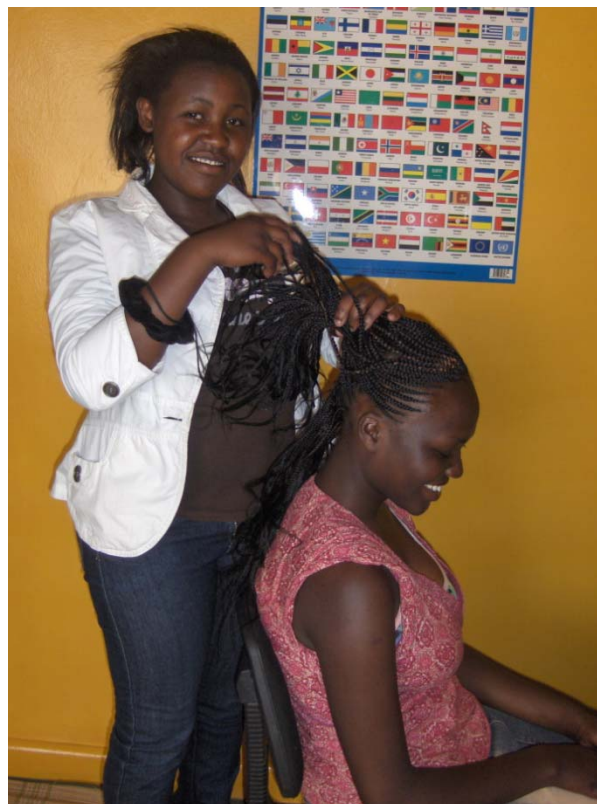
My hobby: hair styling and dancing

That all things are possible when one's dedication is in what they do. To be able to achieve one must have passion and a never give up attitude no matter what comes their way.