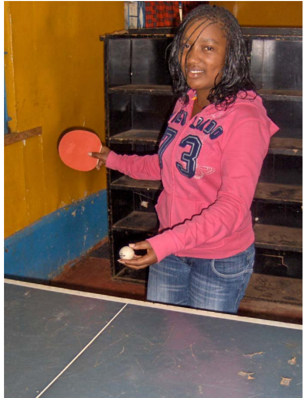
My hobbies: table tennis, dancing and singing

How to maintain a garden and plant flowers. I learnt that we all need one another regardless of our career areas, as I learnt that when the engineers are surveying land for development, they consider reports from different people for instance, they work hand in hand with sociologists and environmentalists.