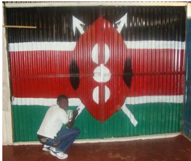
My passion: all kinds of art work and designing

Drawing, painting and creation of proper display. I participated in the MMH Shop upgrade project and painted the Kenyan flag at the shop. Moreover I taught my fellow students how to draw and paint portraits.