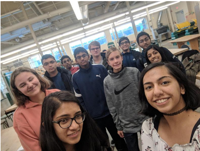
FEDS: Mentoring at Reuther Middle School