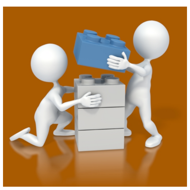
Please join us for this exciting conference at the

wvu Health Sciences Center on the campus of wvu Healthcare