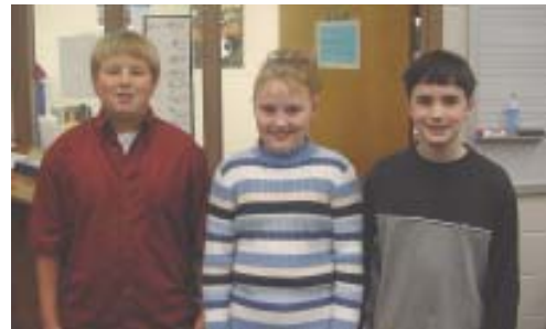
SD State Elementary Honors Chorus members.