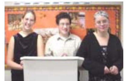
Winners of the JH Quiz Bowl.

After a round robin of play, Team 21 placed third with 390 points, Team 24 placed second with 400 points, and Team 17 answered the most questions correctly scoring 440 points. Congratulations Team 17!