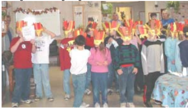
Wearing their turkey masks, second graders visit the Elk Point nursing home to sing songs to the residents.

Early in October, first graders started a reading project which also earned books for children in need. The class goal was to read 100 books. The students kept a running record of the number of books read on a poster in their classroom. Everyone was very excited when the goal was reached at the end of November. The project results were reported to Scholastic Books who has pledged to give 100 books to children who need them. Scholastic provides the books while several charities such as Save the Children and " I Have a Dream Foundation " will distribute the books. It is estimated that over two million books will be given to kids in need. During the holiday season with its message of caring and giving, this was a great project for the first graders!