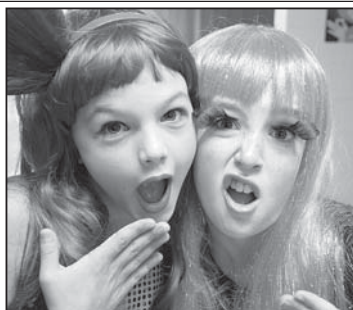
EPJ students enjoy the Homecoming dress-up days.