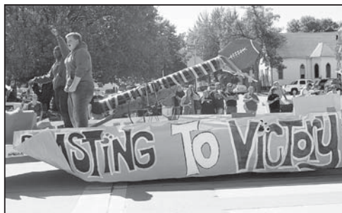
Blasting to victory, the sophomore float wins first place in the float competition.