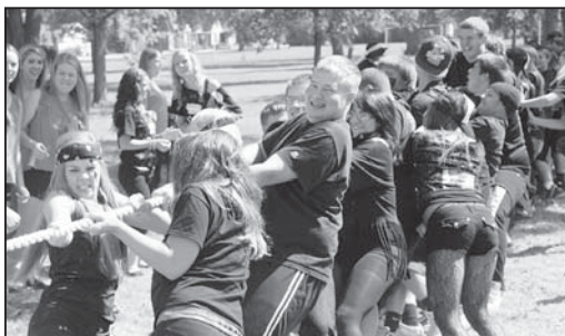
Seniors show their strength by winning the tug-of-war during Picnic in the Park.