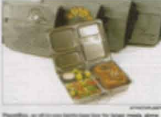
Stainless, an alternative produce bag for larger bags, along with Carry Bags, is shown here.

There's nothing wrong with a little jazz. Especially if it's yours. Onions are a staple in many cuisines. They are used in soups, stews, and salads. They are also used as a garnish for many dishes.