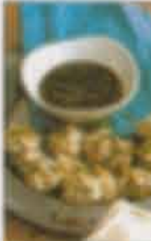
Stuffed dumplings with a spicy ground beef filling, then drizzled with a creamy sesame sauce.