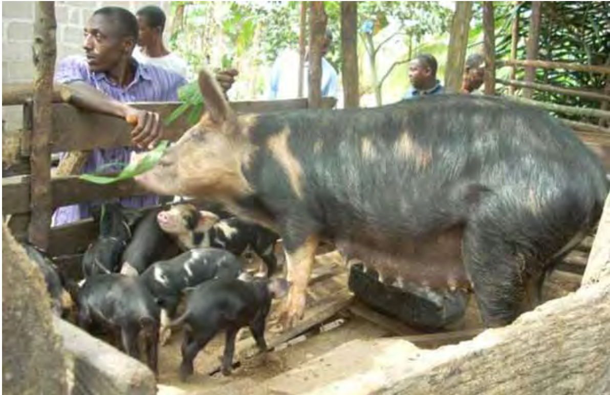
Pig farms developed by Community Action for Development in the Southern Bakundu Reserve area