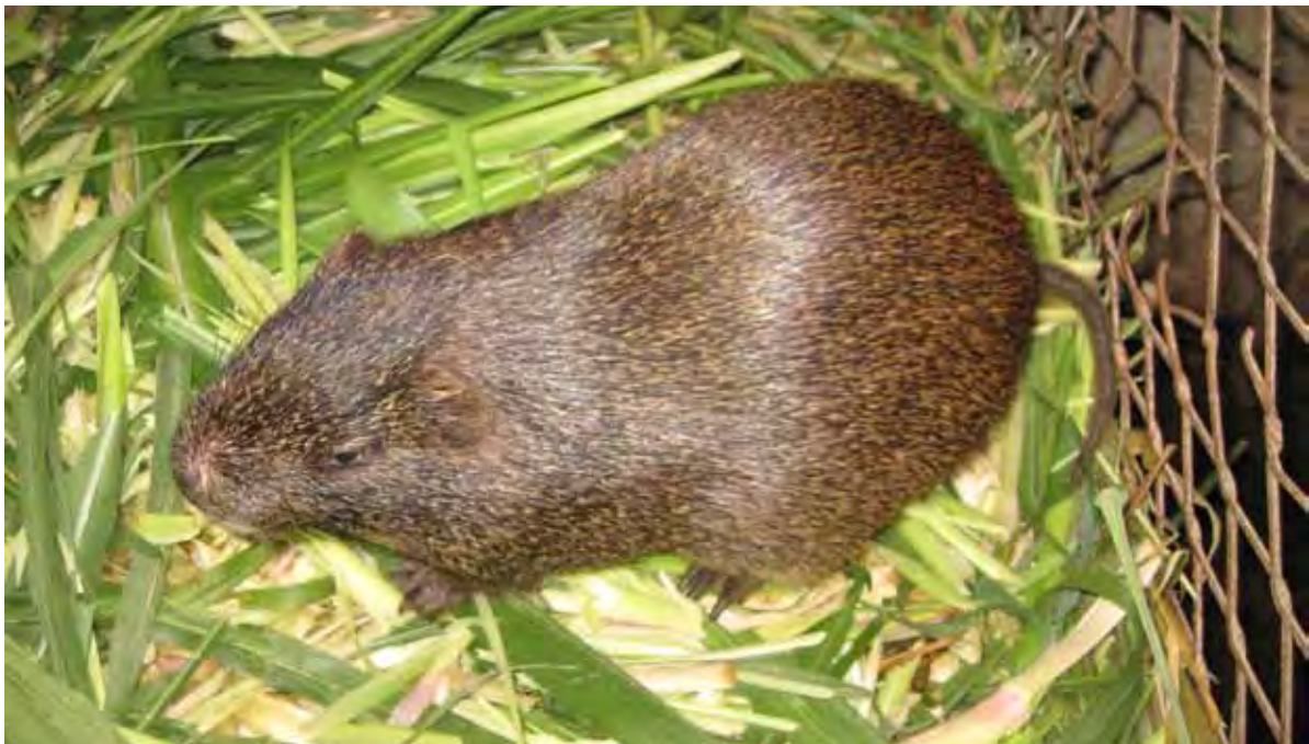
Grasscutter farm at the Faculty of Agronomy, University of Kisangani (Democratic Republic of Congo)