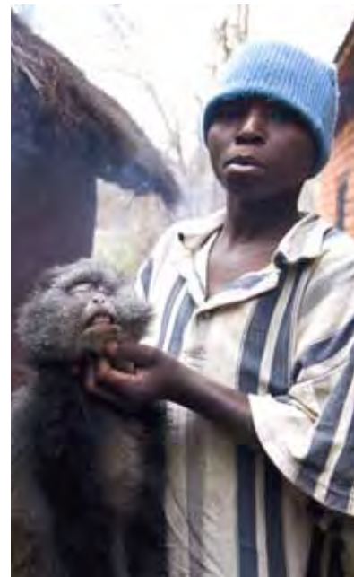
Young man showing a Sykes monkey in Tanzania

For many, the costs of certification itself may be prohibitive. Examples from the field highlight the need for significant donor investment at least in the initial stages. Unless subsidised by donor funding, the initial costs of certification to the communities will be high. Direct costs will vary depending on the number of communities applying for certification and the distance that certifiers have to travel. In the case of wildlife certified products, indirect costs will include the investment needed to ensure that local communities set up sustainable wildlife management schemes that meet certification standards (training in sustainable hunting practices, development of community-based management plans and no-hunting zones, establishment of hunting registers) and the transport of certified products. What is not always clear from existing certification initiatives is whether certification does indeed generate higher prices than non-certified products, which is indeed the only guarantee that beneficiaries will comply with conservation goals. In order to ensure conservation benefits, certified products should guarantee higher benefits than non-certified products, not only on the short term but also over the long term. For wildlife certified products, any drop in prices of certified products would indeed lead to a shift towards unsustainable hunting practices with dramatic effects on wildlife, in order to respond to the existing demand for wildlife products.