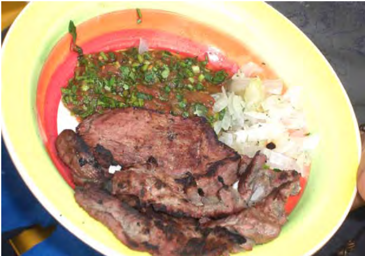
Meat of red brocket deer in a community neighbouring the Calakmul Reserve (Mexico)

The preference for bushmeat is also dictated by cultural reasons, particularly for indigenous peoples. Many cultures still employ traditional medicine that includes animal-derived remedies (Alves and Alves, 2011) and animals often fulfil both a nutritional and a medicinal role. Probably the most famous of these are the Chinese, who use animals for a variety of ailments. Many vertebrates, including tigers, bears, rhinos, turtles, snakes, tokay geckos, pangolins, monkeys and swiftlets are traded as raw materials of traditional Chinese medicine. Lesser known and studied, though just as varied and rich is Latin America's long tradition of animal-remedies for all kinds of ailments. In Africa, bushmeat consumption is also associated with tradition. In some rituals and ceremonies, such as men's circumcision ceremonies in Gabon or burials in South East Cameroon, large quantities of bushmeat must be served to the participants (Angoué et al. , 2000; van Vliet & Nasi, 2008). The traditional role of bushmeat has also been shown in Equatorial Guinea, where some species are considered to have magical or medicinal properties that increase their value (Kümpel, 2006).